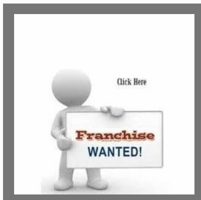
PCD Pharma Franchise