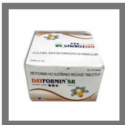
Dayformin SR Tablet