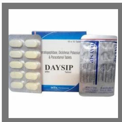
Swelling and Pain Killer Daysip Tablet