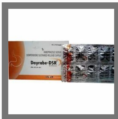
Rabeprazole Domperidone Capsule