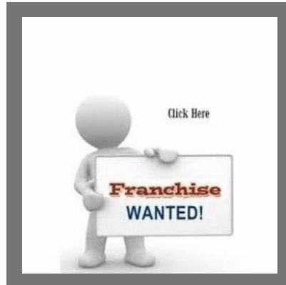
PCD Pharma Franchise Monopoly Basis