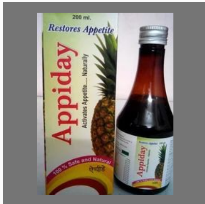
Appitizer Syrup Appiday