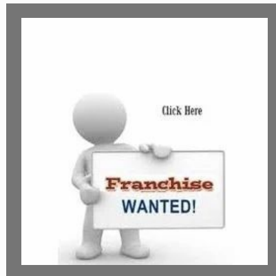
Pharma Franchise for Punjab