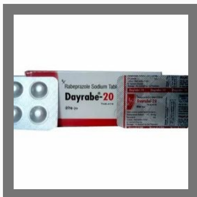
Gastritic Tablet Dayrabe-20