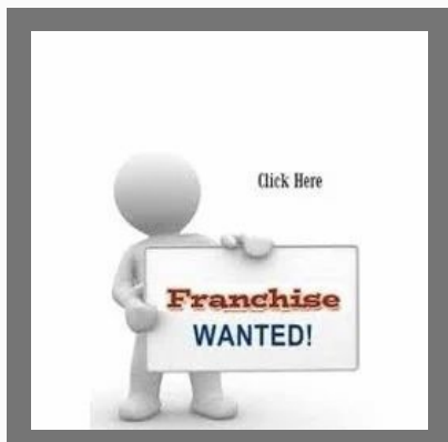
Pharma Franchise for Chhattisgarh