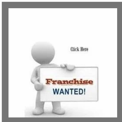
Pharma Franchise for Jammu and Kashmir