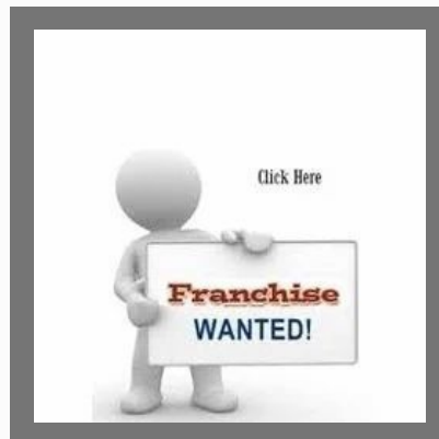
Pharma Franchise for Jharkhand