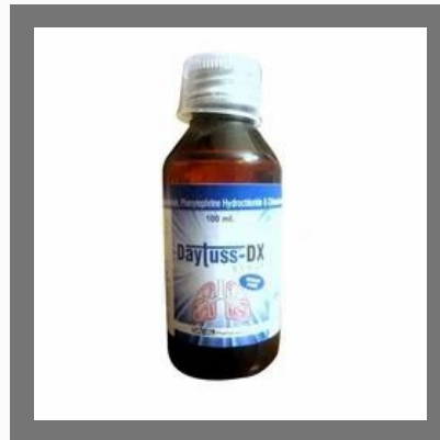
Cough Syrup Daytuss-Dx Syrup