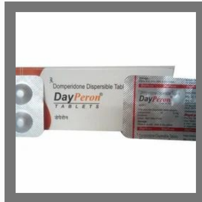
Nausea & Vomiting Day Peron Tablet