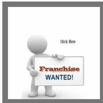
Pharma Franchisee on Monopoly Basis