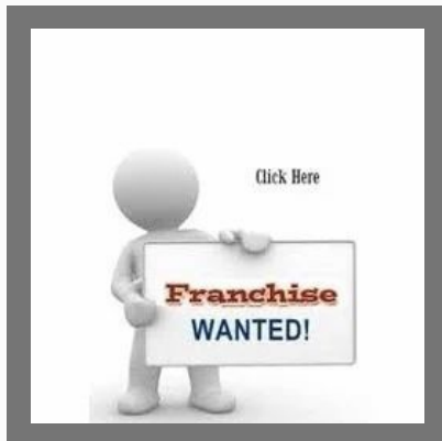
Pharma PCD Franchisee