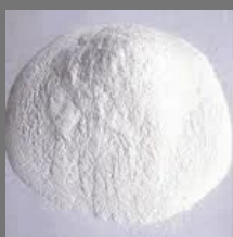
Industrial Pthalamide Derivatives