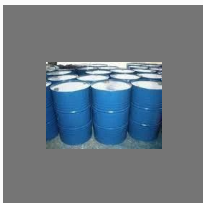
Electroplating Based Intermediates