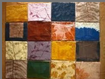
Biological Staining Dyes