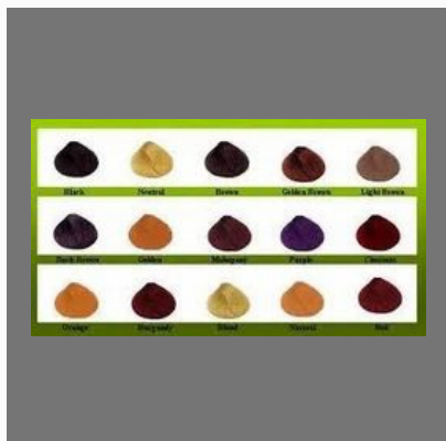
Hair Dye Intermediates