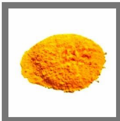
Fast Garnet Gb Base / Solvent Yellow