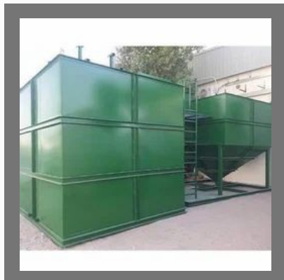
Prefabricated Sewage Treatment Plant