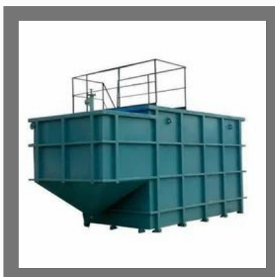
Waste Water Treatment Plant