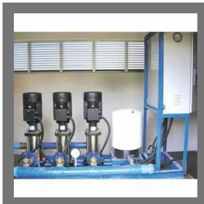
Hydro Pneumatic System