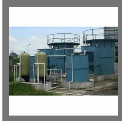
Effluent Treatment Plant