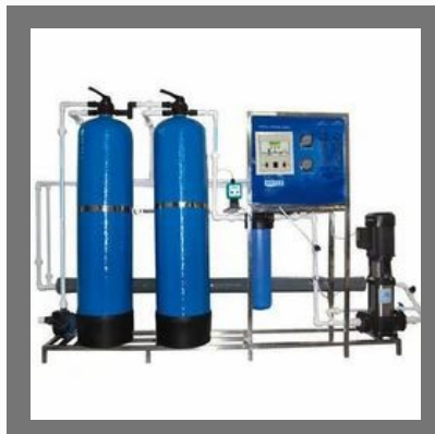
Mineral Water Bottling Plant