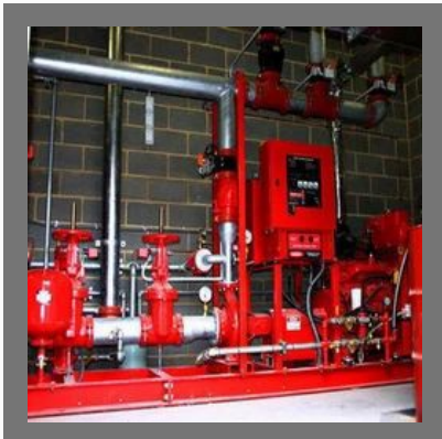
Fire Fighting Plant