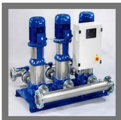
Hydro Pneumatic System