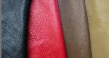
Split Upholstery Leather(On Booty Print,Barton)