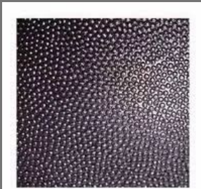
Split Leather (On All Print)