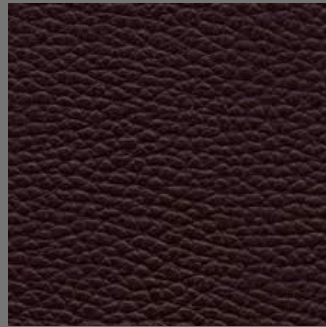
Grain Barton Finished Leather