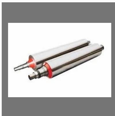
Paper Mill Roller