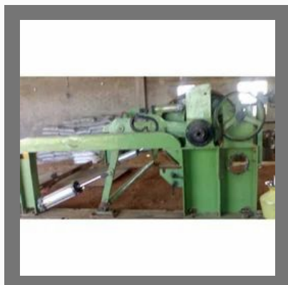
Pope Reel Assembly