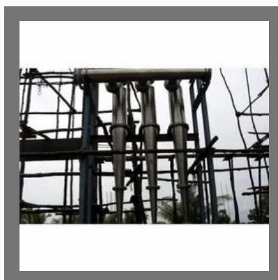
Centric Cleaner Pulping Section