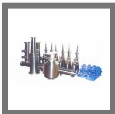
Centric Cleaner System