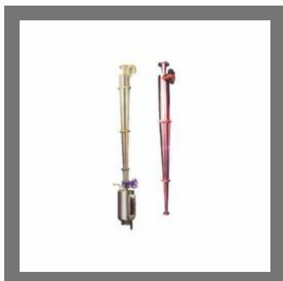
High Density Cleaner