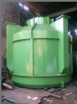
Paper Mill Machinery