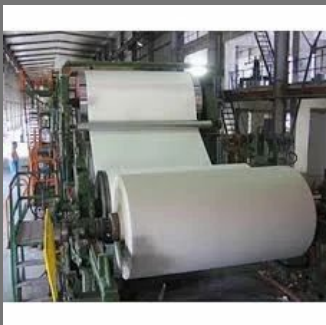
Paper Pulp Machine