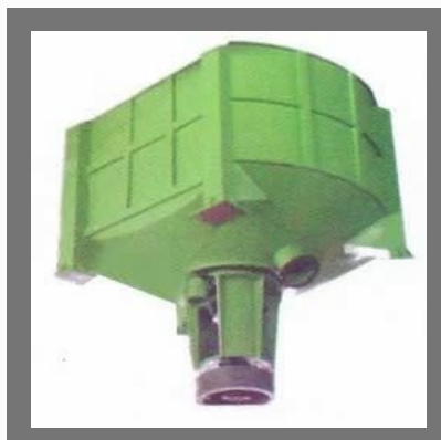
D Type Low Consistency Pulper