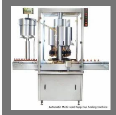
Automatic Multi Head ROPP Cap Sealing Machine