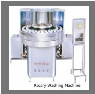
Rotary Washing Machine