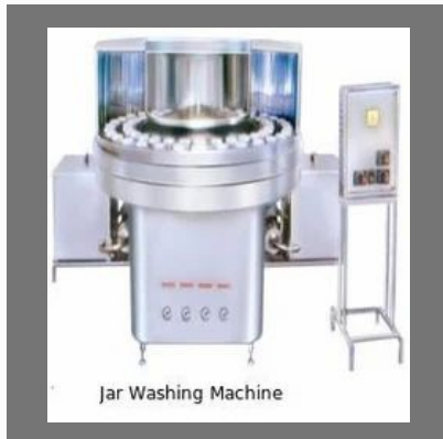
Jar Washing Machine