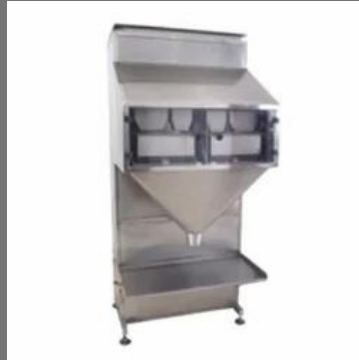
Powder Packaging Machine