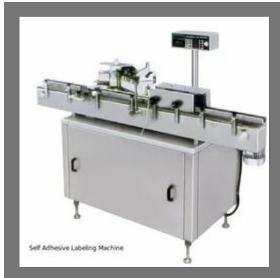
Self Adhesive Labeling Machine