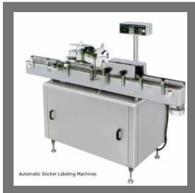
Automatic Sticker Labeling Machines