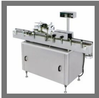
Bottle Labeling Machine