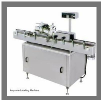
Ampoule Labeling Machine