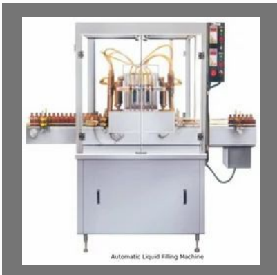
Automatic Liquid Filling Machine