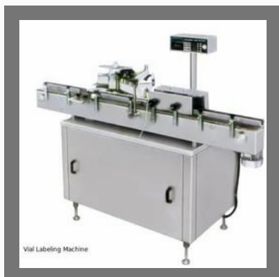
Vial Labeling Machine