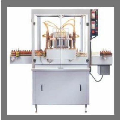
Bottle Filling Machine