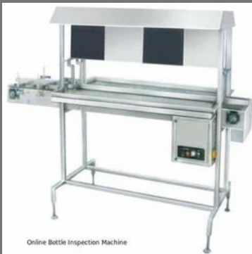
Online Bottle Inspection Machine