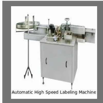
Automatic High Speed Labeling Machine