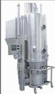
Fluid Bed Coater