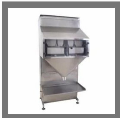
Powder Filling Machine