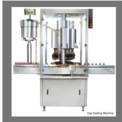
Cap Sealing Machine