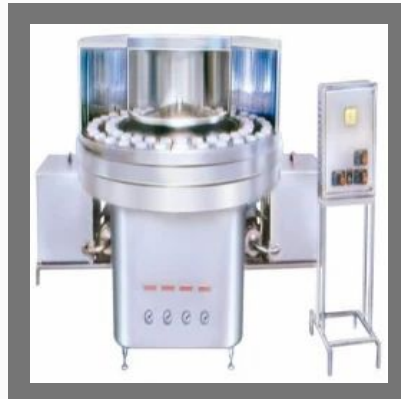
Rotary Bottle Washing Machine