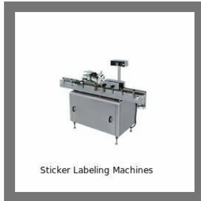
Sticker Labeling Machines