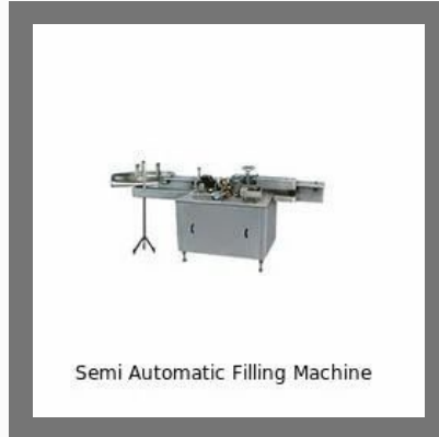
Semi Automatic Filling Machine