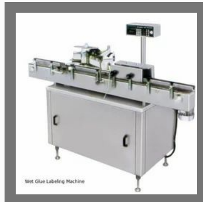
Wet Glue Labeling Machine