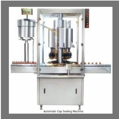
Automatic Cap Sealing Machine