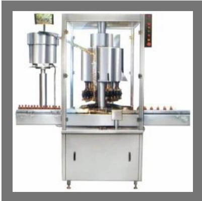
Bottle Sealing Machine