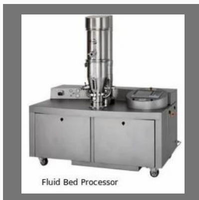
Fluid Bed Processor