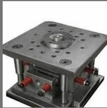
Plastic Moulding Dies