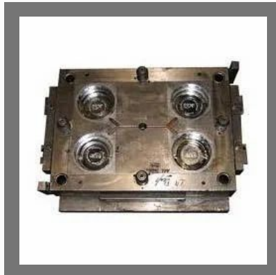
Moulding Blow Dies