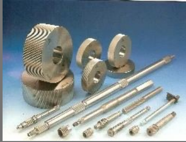
Pipe Roller Dies