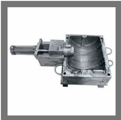
Blow Injection Molding Dies