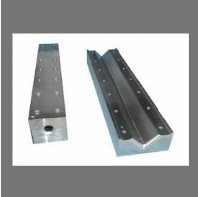
Painting Booth Hangers Dies