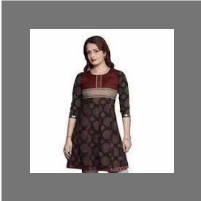
Ladies Fancy Kurti