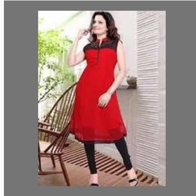
Ladies Long Kurti