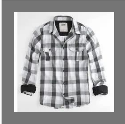
Mens Woven Shirts