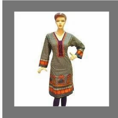
Ladies Stylish Kurti