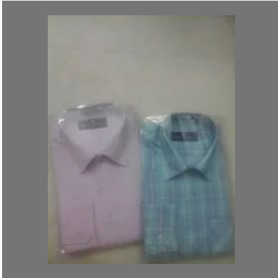
Full Sleeve Shirt