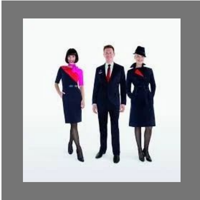
Air Hostess Uniform