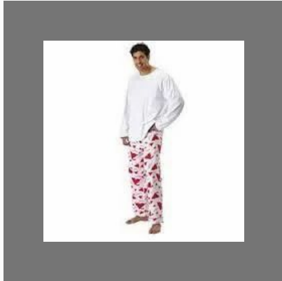
Mens Night Suits