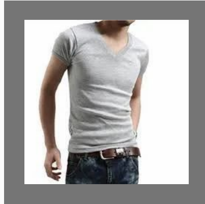
Mens Woven T Shirts