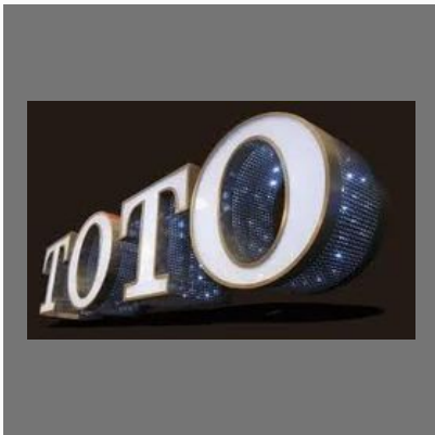
SS Channel Letters