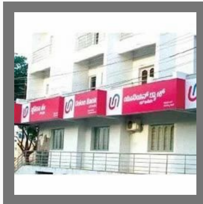
Cut Vinyl Glow Signs