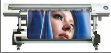
Eco-Solvent Printing for Internal Graphic