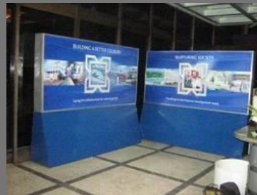
Indoor & Outdoor Digital Printing Solutions