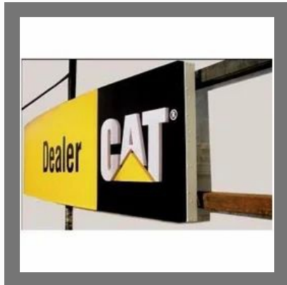
Flex Glow Signs