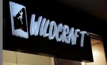
ACP Signage & Fabrication Solutions