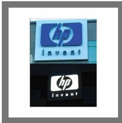
Neon 3D Channel Letters