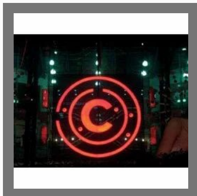
ACP Backlit Signs