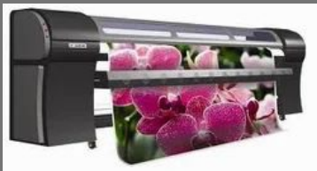
Digital Printing In Solvent