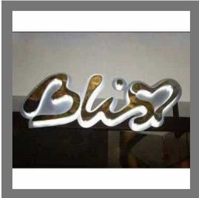
LED Acrylic 3D Channel Letters