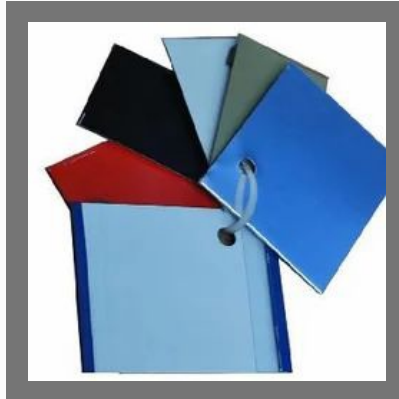
Aluminium Channel Letters