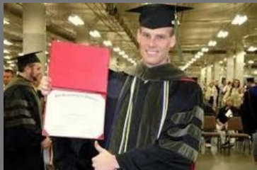
Diploma In Pharm. (D Pharm)