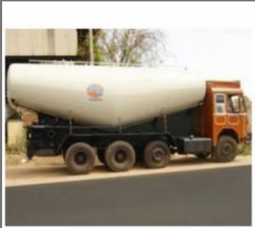
Bulkers For Alumina Powder