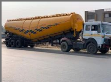
25 Meter Cube Bulkers