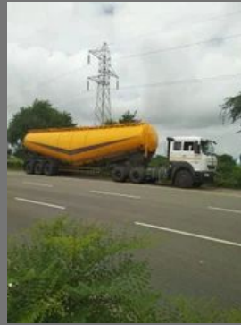
52 Meter Cube Bulk Trailers