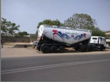
20 Meter Cube Bulklers