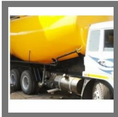
Bulkers For RMC Plants