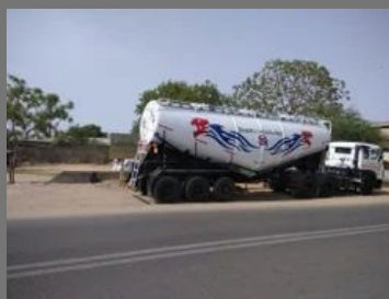
Fly Ash Cement Bulkers