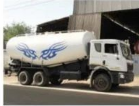
28 Meter Cube Bulklers