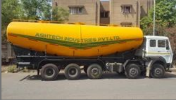
Cement Bulklers .