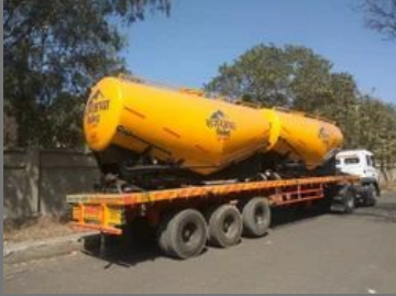
40 Meter Cube Bulk Trailers