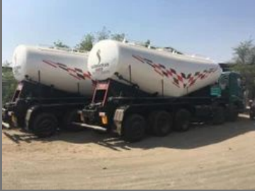
Alumina Bulklers .