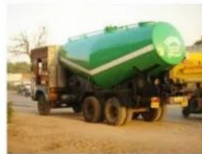
22. 5 Meter Cube Bulklers