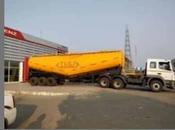
35 Meter Cube Bulk Trailers