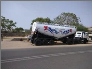
18 Meter Cube Bulklers