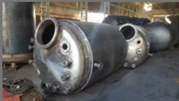
Chemical And Pharmaceutical Reactor Vessel