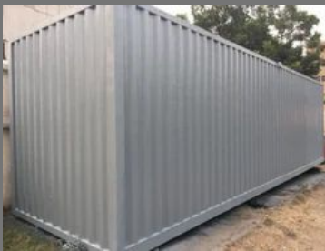
Light Weight Container