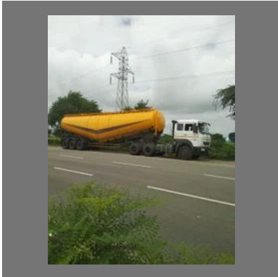
RMC Plant Cement Bulklers