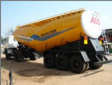
42 Meter Cube Bulk Trailers