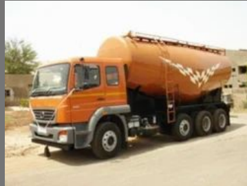
Cement Bulker Tank