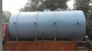
SS Vessel Tank Heat Exchanger