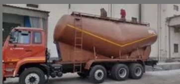
Bulker For Maize Flour