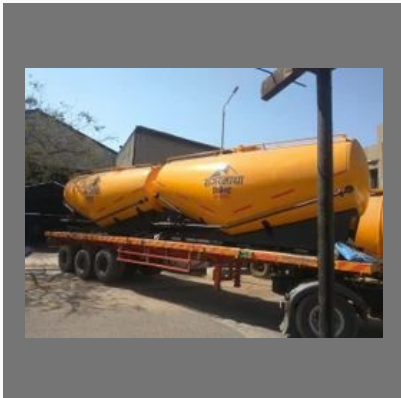
Bulkers For RMC Plants