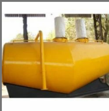
Stationary Bulkers .