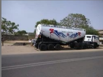
Fly Ash Bulkers