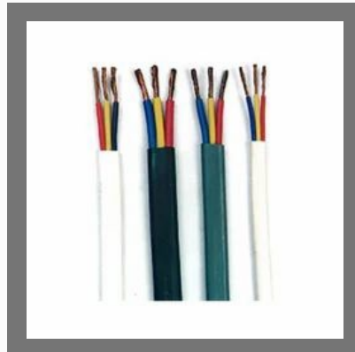
PVC Submersible Cable