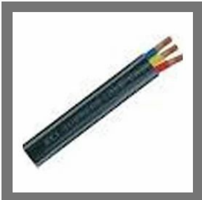
3 Core Submersible Flat Cable