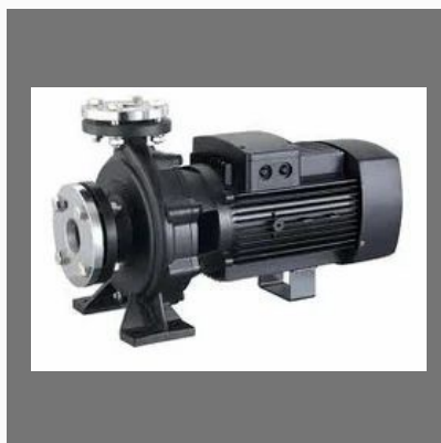
Mono Block Pump