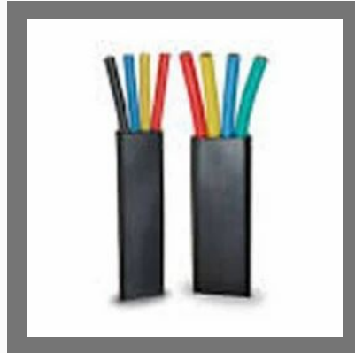
Flat Submersible Cable