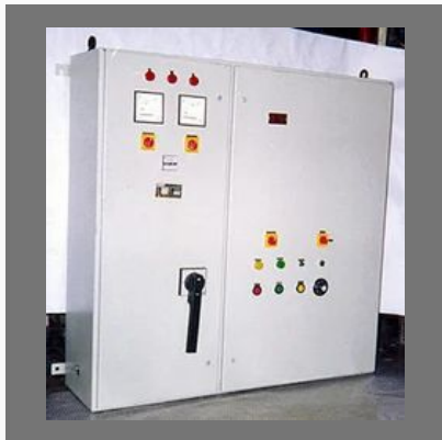
Three Phase Star Delta Panel Board