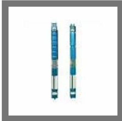
Vertical Submersible Pump