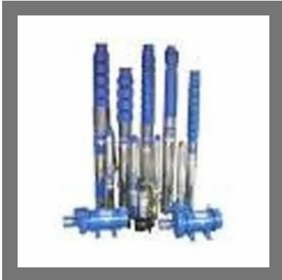
Borewell Submersible Pump