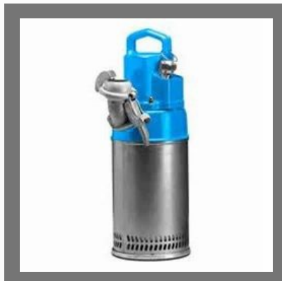
Submersible Drainer Pump