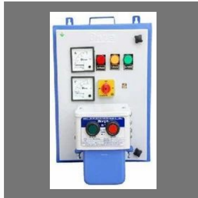
Three Phase DOL Panel Board