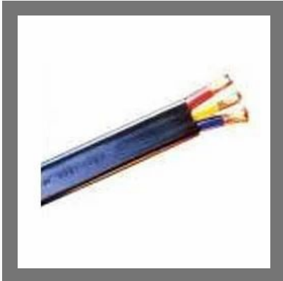
Flexible Submersible Cable