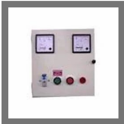
Single Phase Panel Board