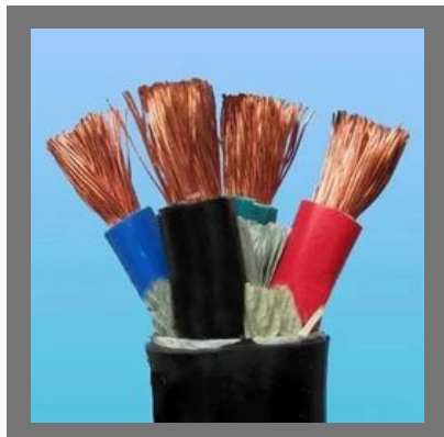
Submersible Round Cable