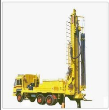
Deep Industrial Bore Wells Service