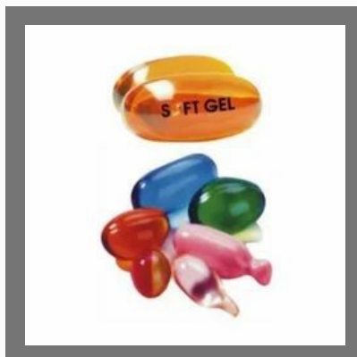
Soft Gel Capsules