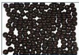
Soaps and Cosmetics