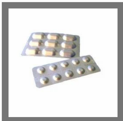
Alu Alu Blister