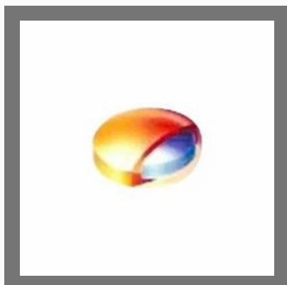
Compression Coated Tablets