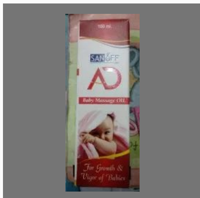
Baby Massage Oil