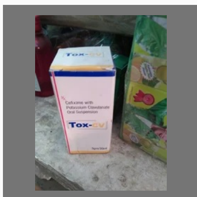
Tox CV Syrup