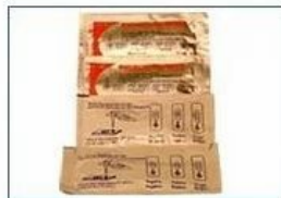
Diagnostic Test Kits