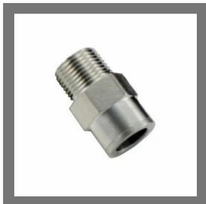
Stainless Steel Connectors