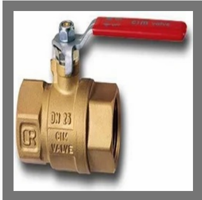
Brass Ball Valves