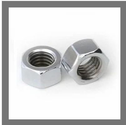
Stainless Steel Nuts