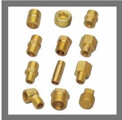
Brass Pipe Fitting