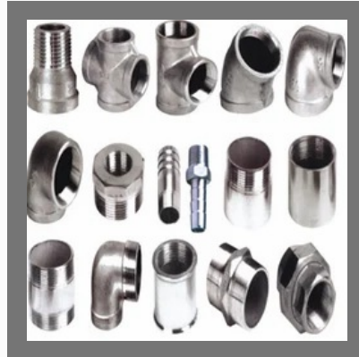
S. S. Pipe Fitting