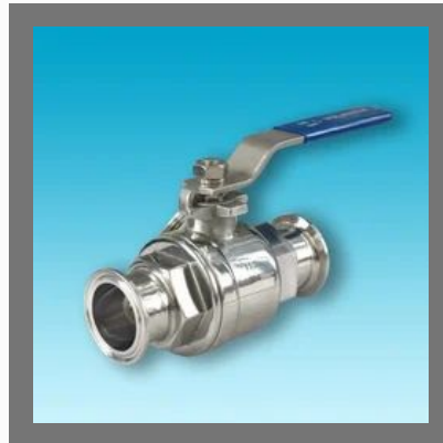
Stainless Steel Valves