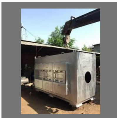
Continuous Brazing Furnace