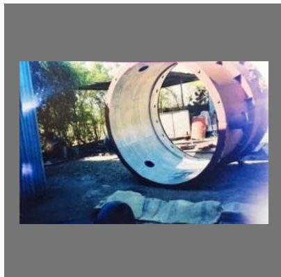
Hastelloy Fabrication Pune