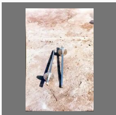
Inconel 600 Thermowells