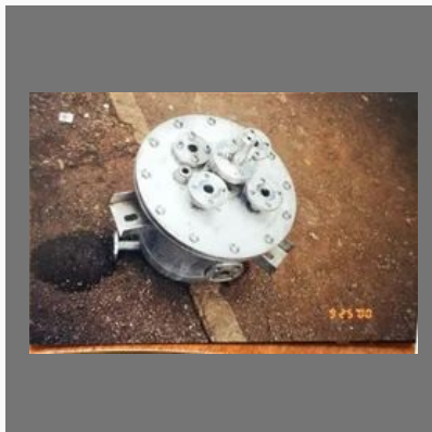
Alloy 20 Fabrication