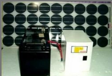
Ecosun Solar Power Pack