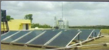
Solar Flat Plate Pressurised Solar Water Heating Systems