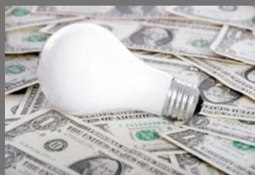
Solar Pumping System Energy Audit Service