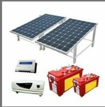
Su-Kam Solar Hybrid Home UPS