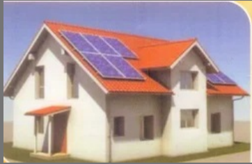
Solar Power Generator And Power Pack