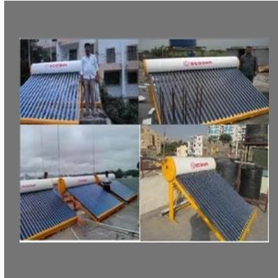
ETC Domestic Solar Water Heater