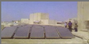
Solar Flat Plate Collector Solar Water Heating System