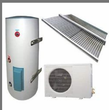
Solar Water Heater with Heat Pump