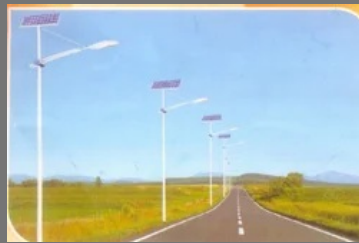
Solar Street Lighting