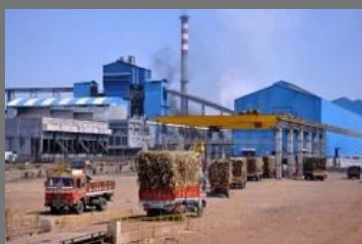
Ecosun Sugar Bagasse Cogeneration Consultancy Service