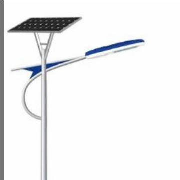
Ecosun Solar Street Light