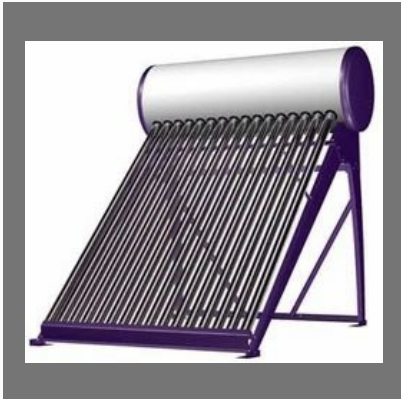
ETC Solar Water Heater