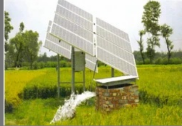
Solar Water Pump