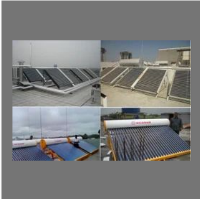
ETC Commercial Solar Water Heater