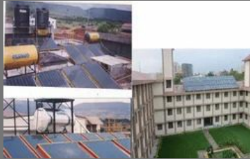
FPC Commercial Solar Water Heater