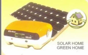
Sukam Solar Hybrid Home UPS