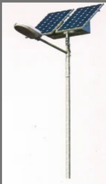
Solar Street Lighting System