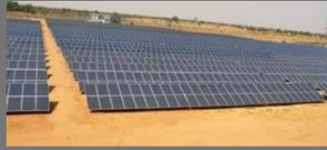
PV Power Plant Implementation Service