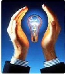
Ecosun Energy Audit Service