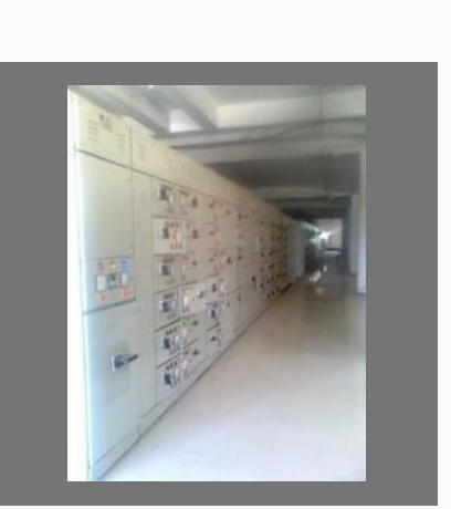
Panel Installation Services