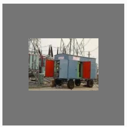
Transformer Oil Filtration Services