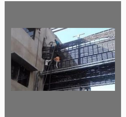
Cable Installation Services