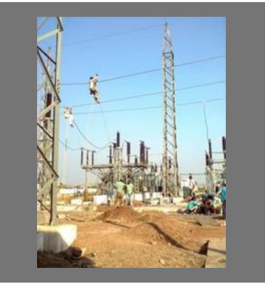
Switchyard Electrical Shutdown Works