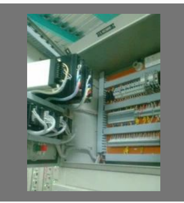
Control Cables Works