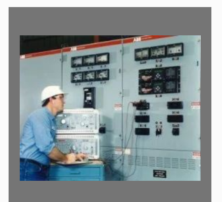
Electrical Testing Services