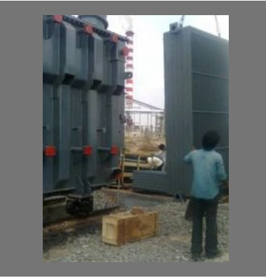
Transformer Oil Filtration & Unloading Services