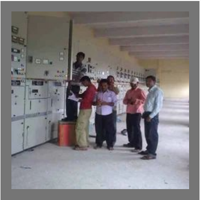
HT Panels And Control Panels Testing