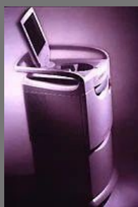
Laser Hair Removal Machine