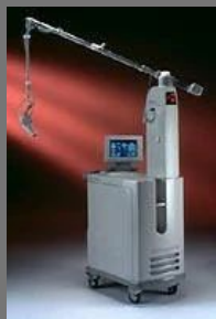
Laser Re-Surfacing Machine