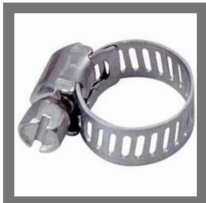
Steel Hose Clamp