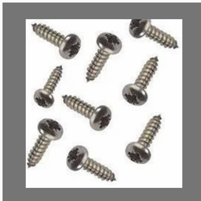
Self Tapping Screws