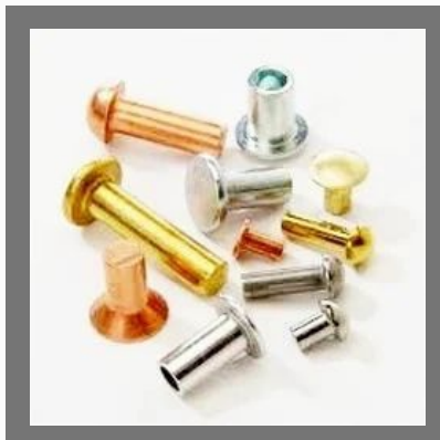
Solid, Tubular And Semitubular Rivets