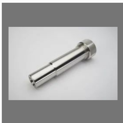
CNC Machined Parts