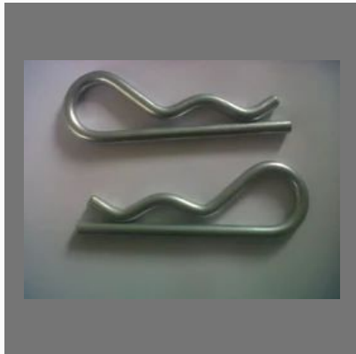
Retaining Clip, R Clip