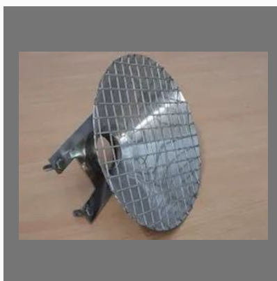
Shrimp Farming Equipments