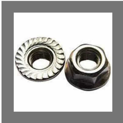
Serrated & Plain Flange Nuts