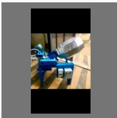
SPM Special Purpose Machines Polishing Barrels