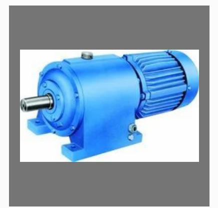
Helical Geared Motor