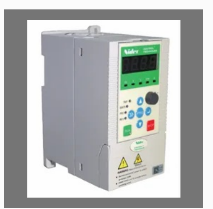
NE200 & NE300 Series -Control Techniques - NIDEC VFD