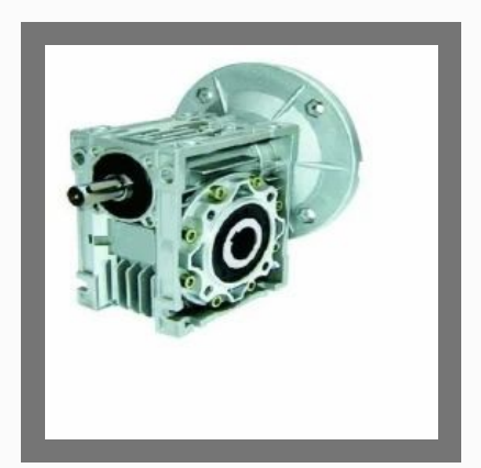
Aluminium Worm Gearbox