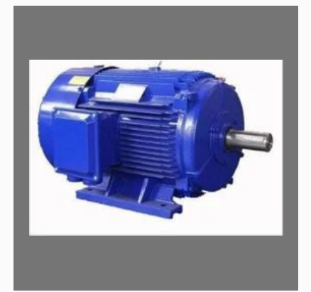
Bharat Bijlee Motor