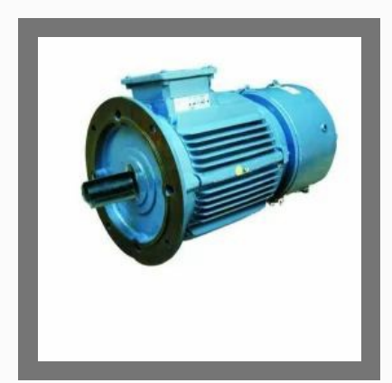
AC Brake Motor