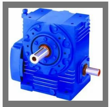
Industrial Worm Gearbox