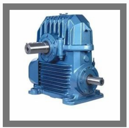
Double Reduction Gearbox