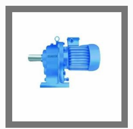
Helical Geared Motor