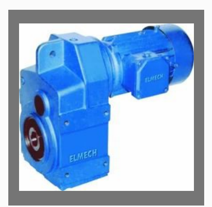
Output Hollow Gearbox