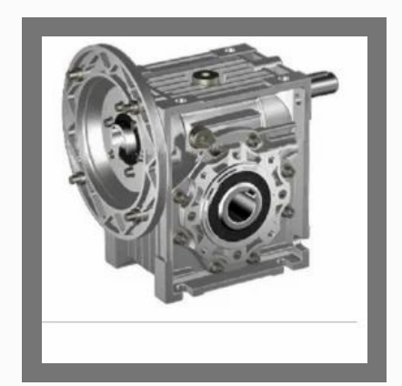
Aluminum Worm Gearbox