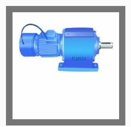
Geared Brake Motor