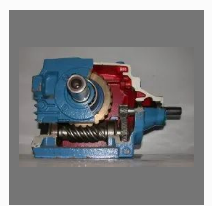
Custom Built Gearbox