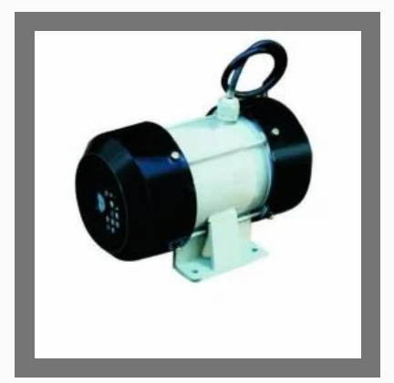
Industrial Vibratory Motor