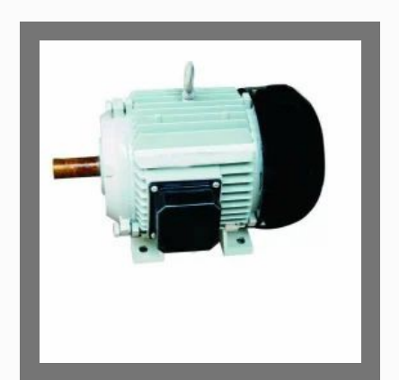
Aluminum AC Motor