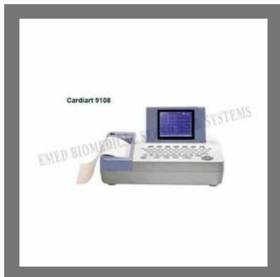
ECG Recording System