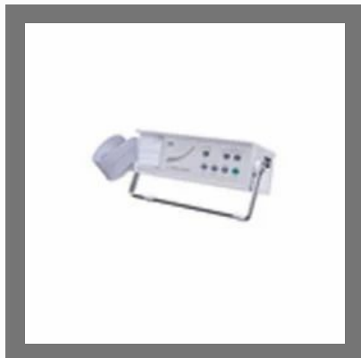
Single Channel ECG Recorder