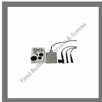
Diathermy Patient Plate