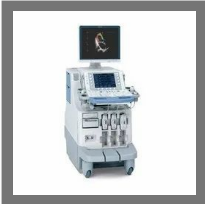
Toshiba Ultrasound Machine