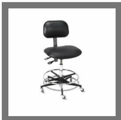
Economy Anesthesia Chairs