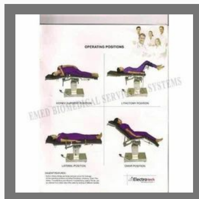
Hydraulic Surgical Operating Positions