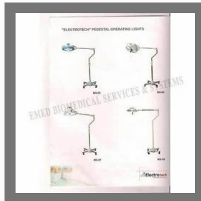
Pedestal Operating Lights