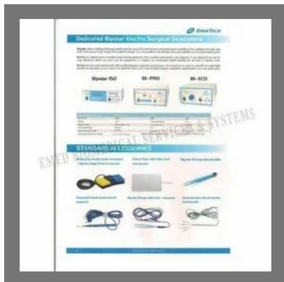
Bi Polar Cables