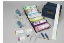
Broselow Pediatric Resuscitation System