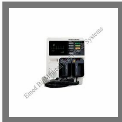
Lifepak 9 Defibrillator