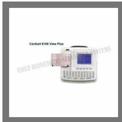
ECG Recording System