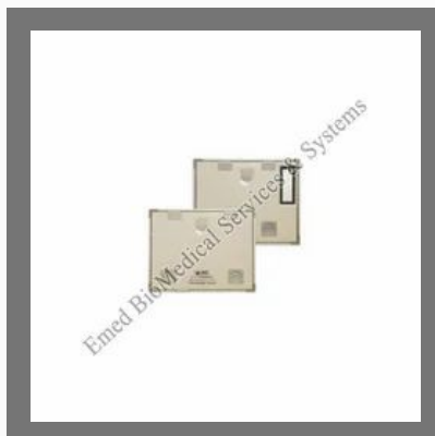
X Ray Cassette