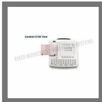
Advanced ECG Machine