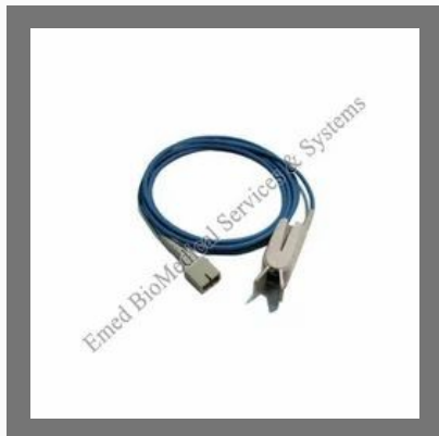
Pulse Oximeter Probe