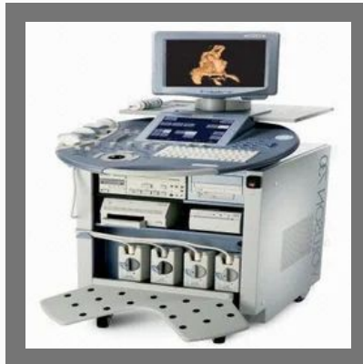
GE Ultrasound Machine