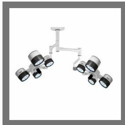
LED OT Light