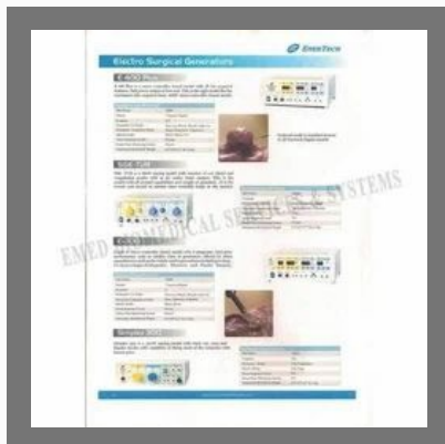
Electro Surgical Diathermy