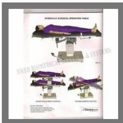
Hydraulic Surgical Operating Table