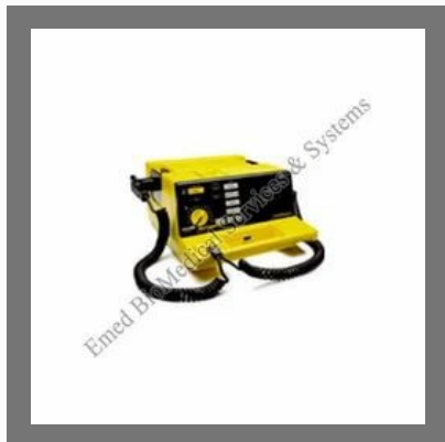
High Performance Defibrillator