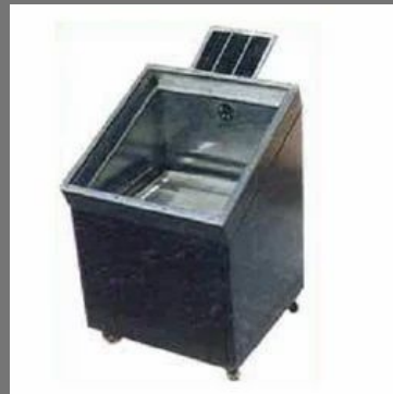
Solar Air Dryer