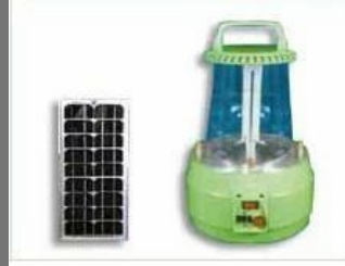
Solar Portable Lanterns