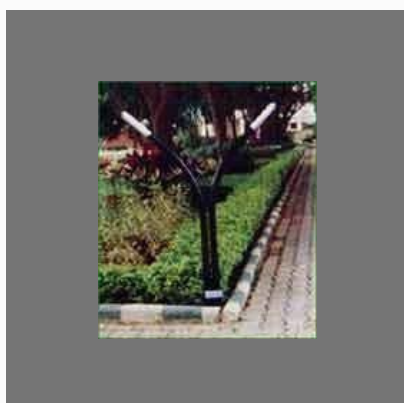
Solar Lighting Systems