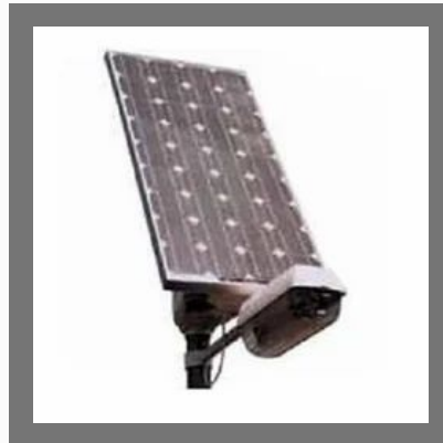
Solar LED Street Lighting System