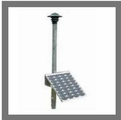
Solar Garden Lighting