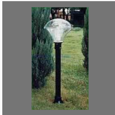
Solar Lighting Systems