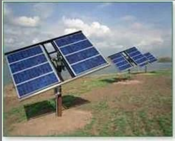
Solar DC Water Pumps