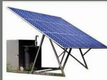
Solar Power Packs