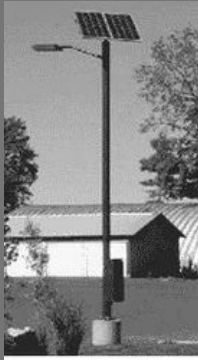
Solar Street Lighting System