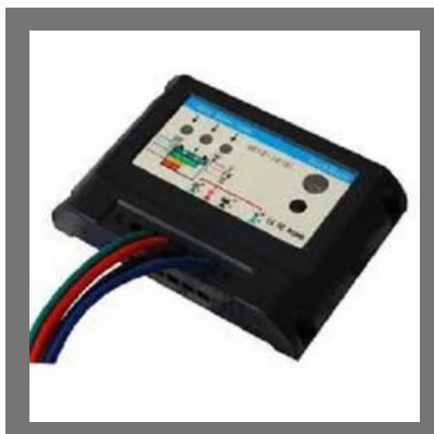
Solar Charge Regulator