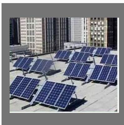
Solar Power Plants