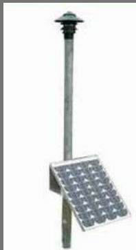
Solar Garden Lighting Systems