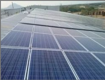
Solar Off-Grid Power Packs