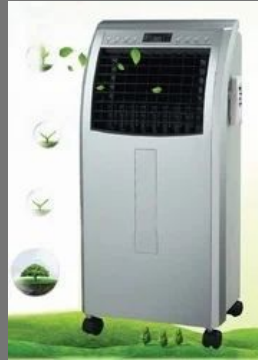
Solar DC Air Coolers