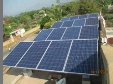
Solar Grid Tie Power Plant