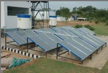
Solar Industrial Water Heating