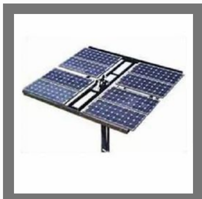
Solar Water Pump