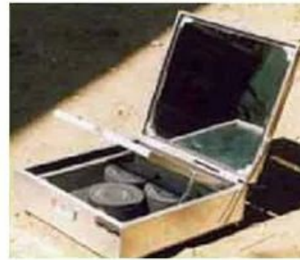
Solar Box Cooker