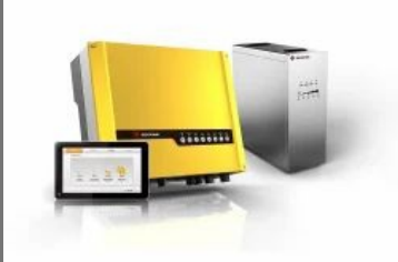
Solar Off Grid Inverters