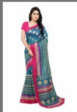
Bhagalpuri Silk Saree (aamh9sr102avs_blue & Pink)