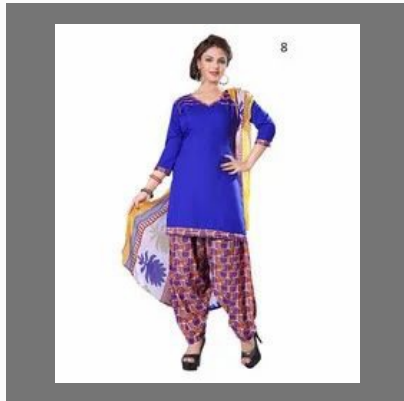
Unstitched Punjabi Suits