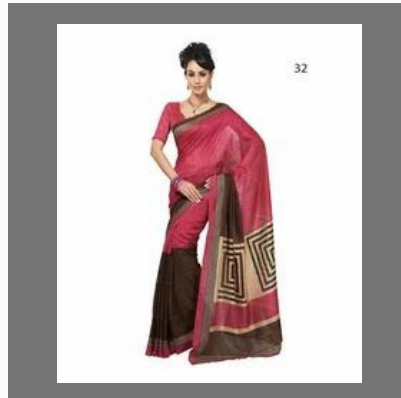
Beige Floral Print Bhagalpuri Silk Saree