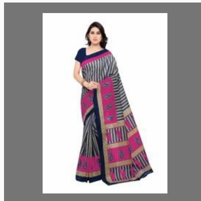
Saree ( AAMI8SR104AVS_Dark Blue & Pink)