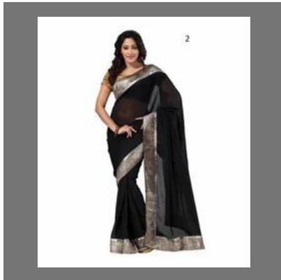
Plain With Border Chiffon Saree