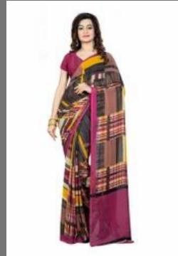
Latest Georgette Saree