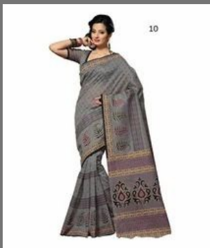
Cotton Border Saree