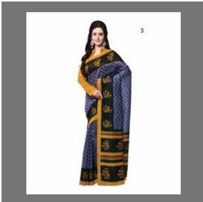
Printed Art Silk Saree