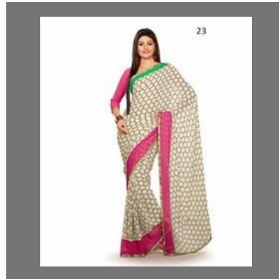
Geometric Printed Saree