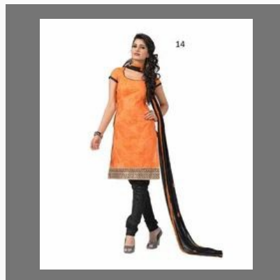
Pure Cotton Dress Material