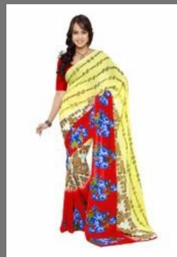
Multicolor Georgette Saree