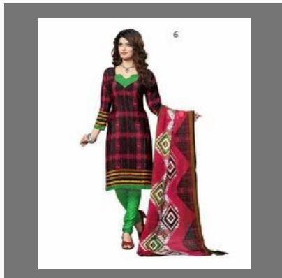
Awesome Crepe Dress Material