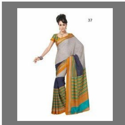
Designer Silk Saree