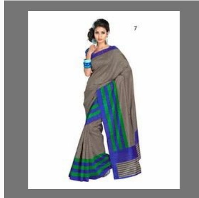
Trendy Bhagalpuri Silk Saree