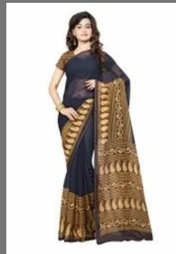
Sarees(Women's Georgette Blue Saree With Blouse Piece)