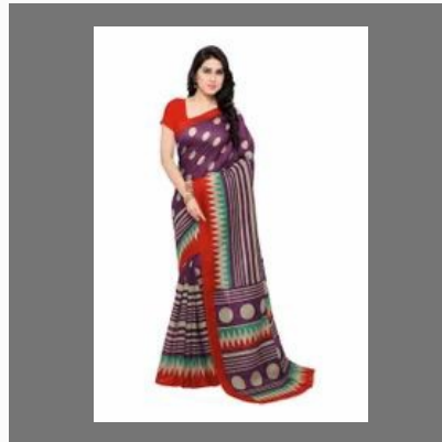
Saree (AAMI3SR102DVS_Purple & Red)