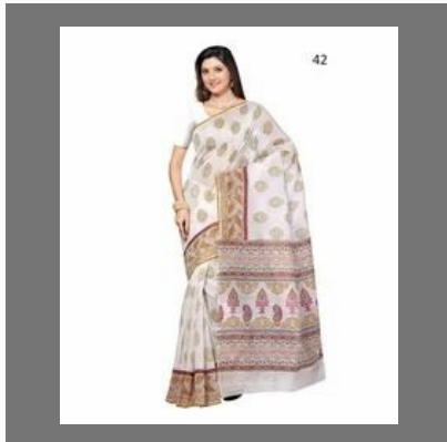
Geometric Print Cotton Saree