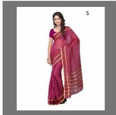
Ethnic Cotton Saree