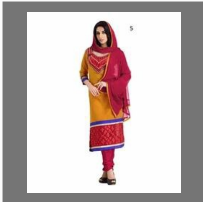
Formal Wear Dress Material