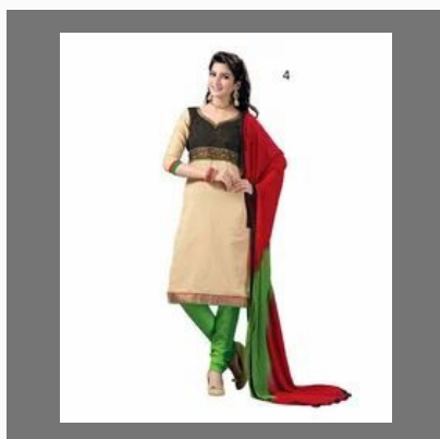
Trendy Cotton Dress Material