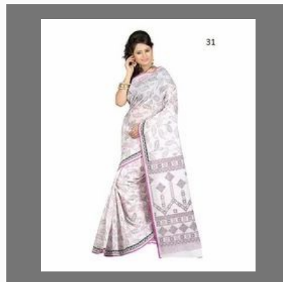
White Cotton Saree