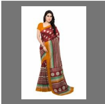
Saree (AAMI2SR102CVS_Maroon & Orange)