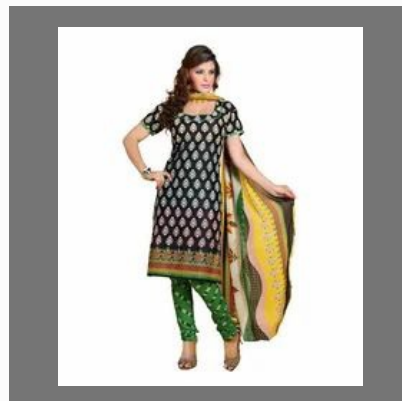
Printed Dress Material