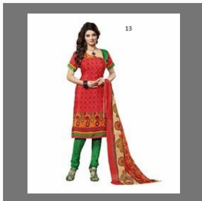
Crepe Dress Material