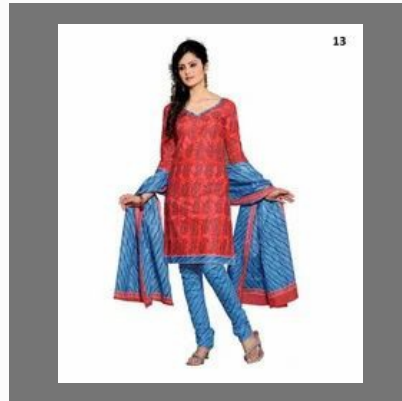
Attractive Dress Material