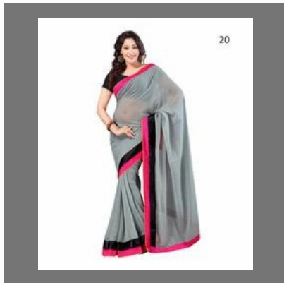
New Arrival Chiffon Sarees