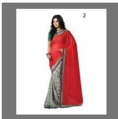
New Arrival Sarees