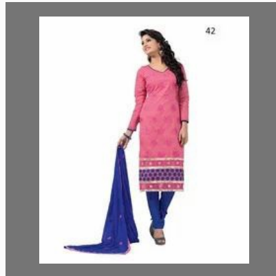
Cotton Dress Material