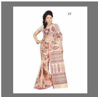
Cotton Saree for Ladies