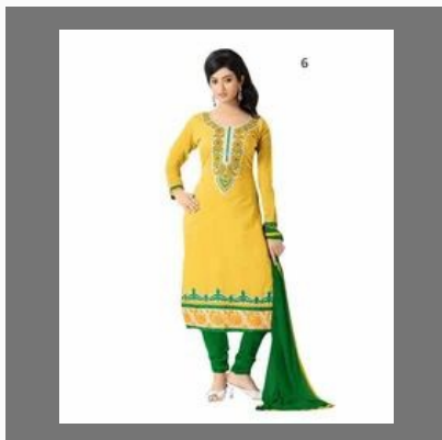
Traditional Wear Dress Material