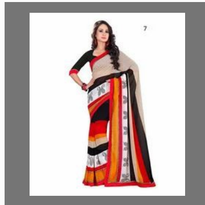
Latest Fashion Chiffon Saree