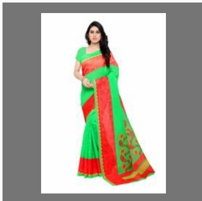
Saree(AAMI4SR103AVS_light Green & Red)