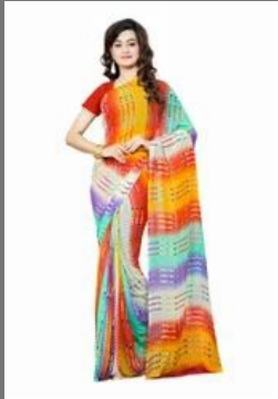
Casual Wear Saree