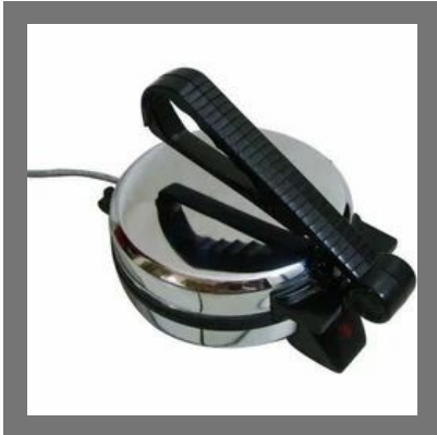
Electrical Chapati Maker