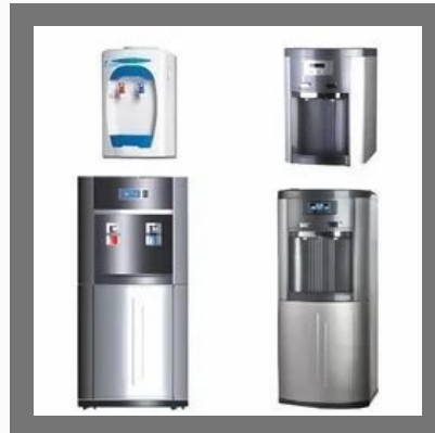
Hot & Cold Water Dispenser