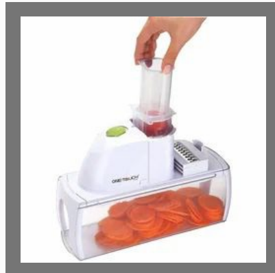
Electrical Vegetable Slicer