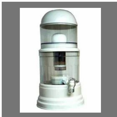
Several Stage Mineral Water Pot