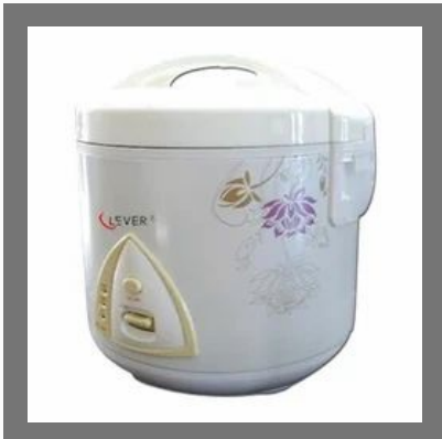
Electrical Rice Cooker