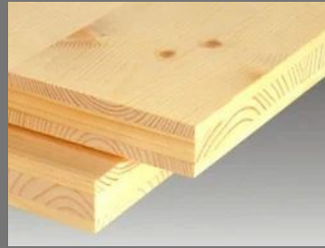
Sandwich Paneling Board