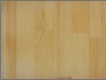
Finger Jointed Board