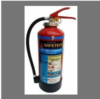
DCP Fire Extinguisher