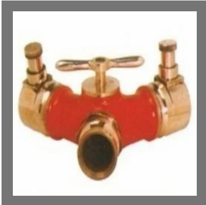
Dividing Breech with Control