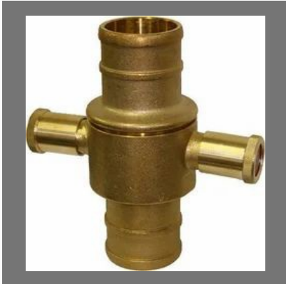
Fire Hose Coupling