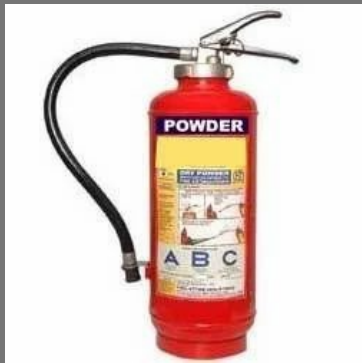
Dry Powder Squeeze Grip Cartridge Type Fire Extinguisher