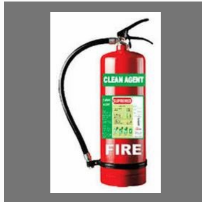
Clean Agent Fire Extinguisher