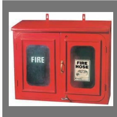
Double Door Hose Box