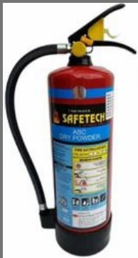
ABC Dry Chemical Powder Stored Pressure Fire Extinguisher