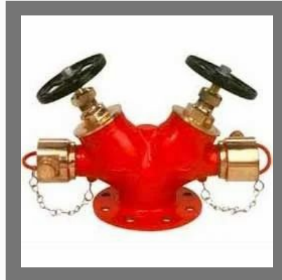
Double Headed Hydrant Valve