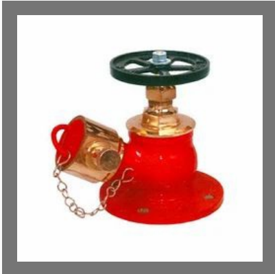
Single Headed Hydrant Valve