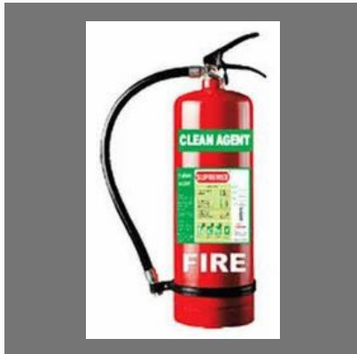
FB 5X Fire Fighting Equipments