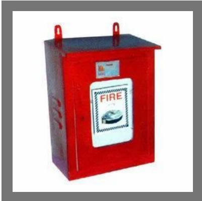
Single Door Hose Box