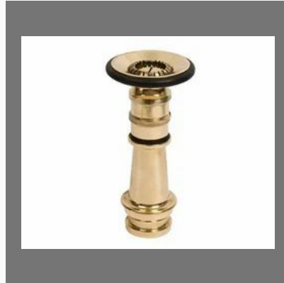
Triple Purpose Nozzle