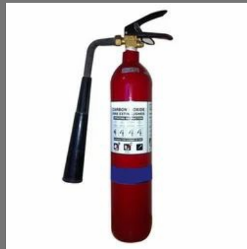
Carbon Dioxide Fire Extinguisher