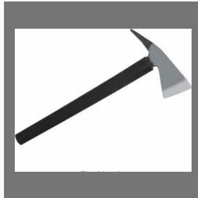
Fire Man Axe