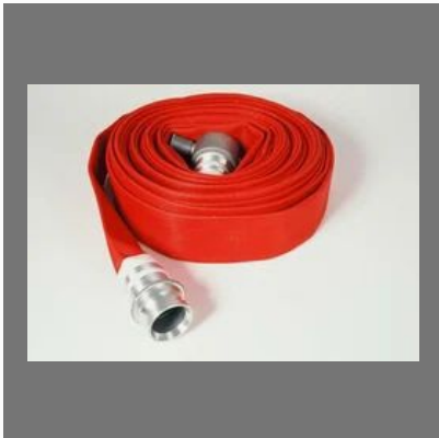
Fire Hose Pipe