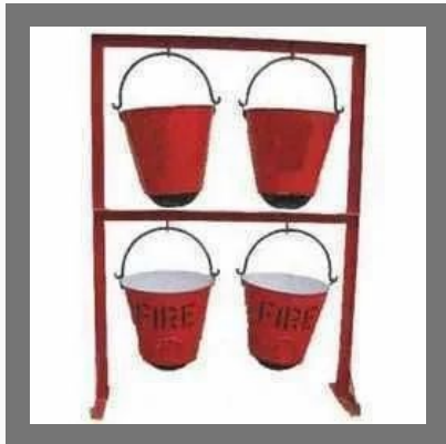
Folding Fire Bucket Stand