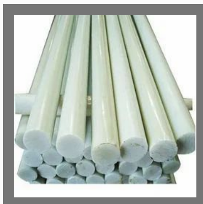
ECR Pultruded ROD