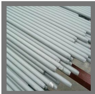
Fibre Glass Rods