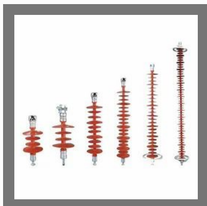
Fiber Glass Rods for Polymer Insulators