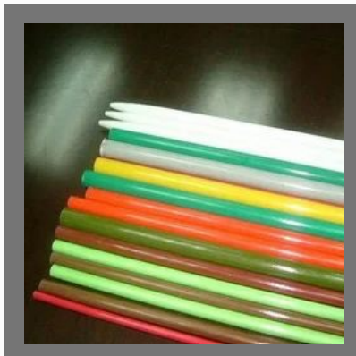
Glass Fiber (Epoxy & Polyester) Rods