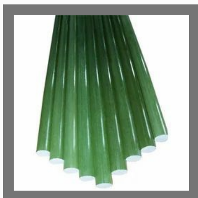
Glass Epoxy Rod