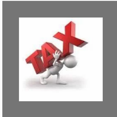
Income Tax Services