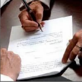
Service Tax Registration Services