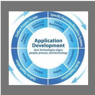
Application Development Services