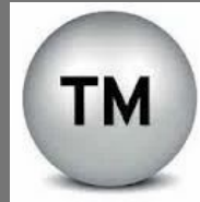
Trademark Registration Services