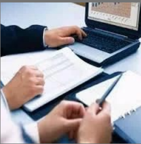
NGO Registration Services