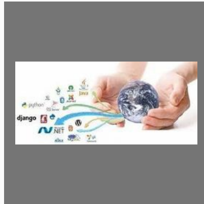
Software Development Services