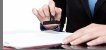
Company Registration Services