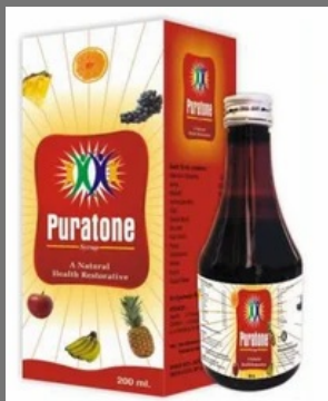
Health Supplement Syrup