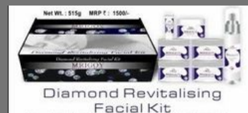
Diamond Facial Kit