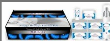
Young & Soft Facial Kit