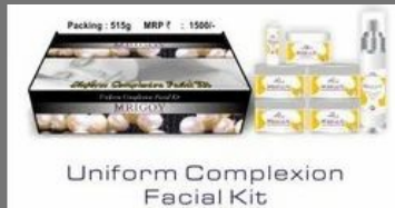
Uniform Complexion Facial Kit