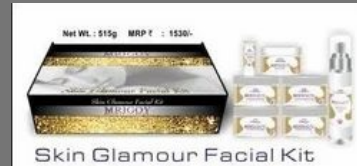
Skin Glamour Facial Kit