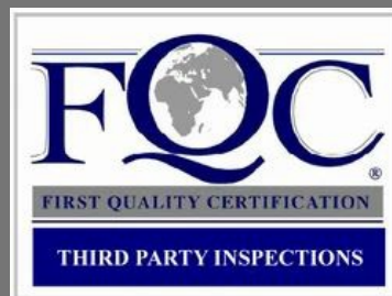
Third Party Services