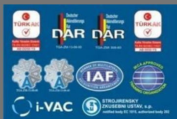
Accreditation & Representation Service