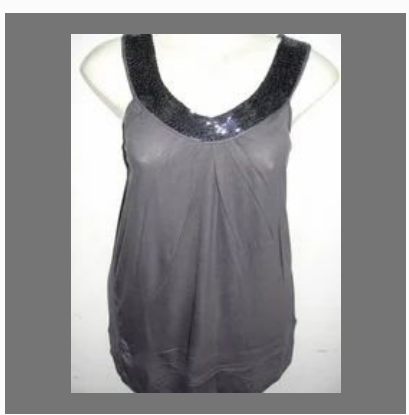
Ladies Trendy Tops