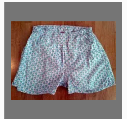
Mens Boxer Shorts