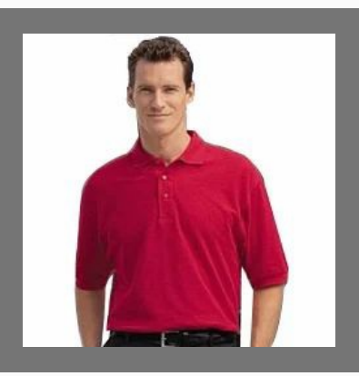
Mens Golf T-Shirts