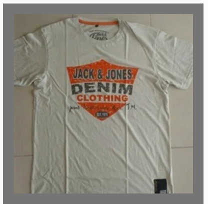
Printing T Shirts