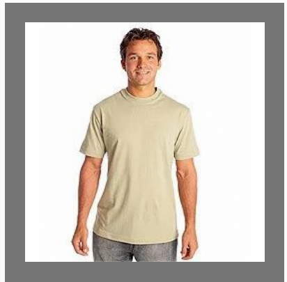
Mens Basic T-Shirts