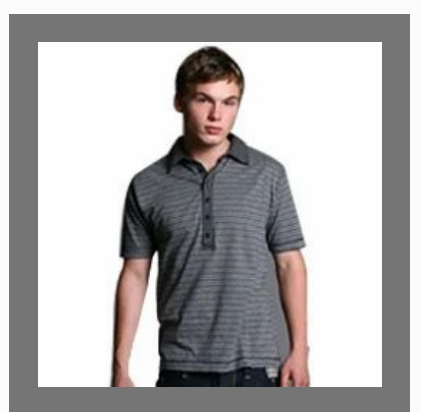
Mens Polo T-Shirts