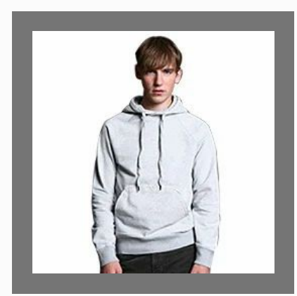
Mens Hooded Sweatshirts