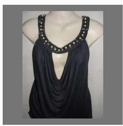
Ladies Sequin Tops