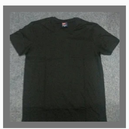
T Shirts Grey Color