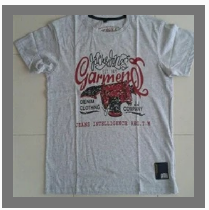
Mens Collar T Shirt