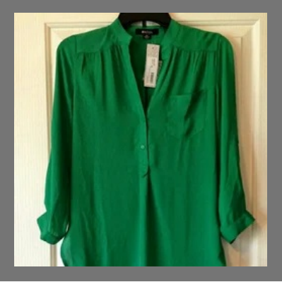
Green Color Ladies Tops