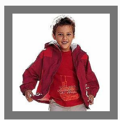
Boys Printed T-Shirts