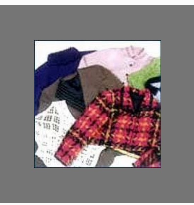
Stock Lot Garments