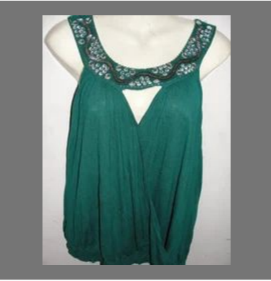
Ladies Designer Tops