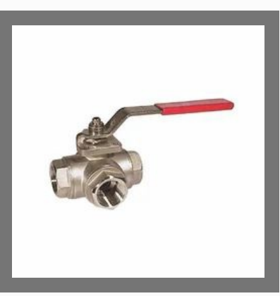
Gauge Cock Valves