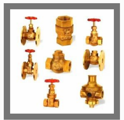
Gun Metal Valves