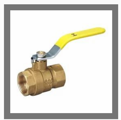
Brass Ball Valves