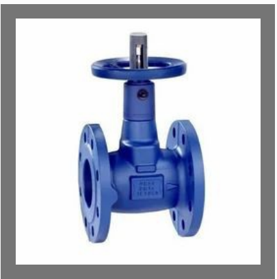
Flanged Globe Valves