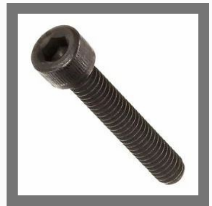
High Tensile Bolts