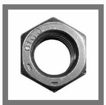
Hex Head Nuts