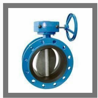
Flanged Globe Valves