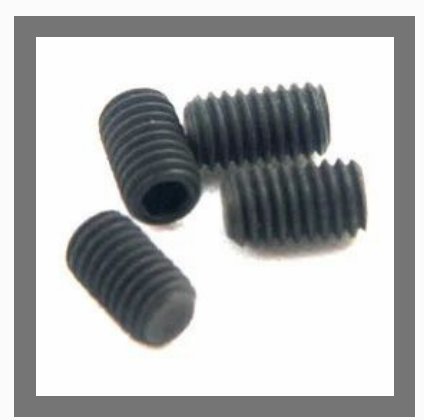
NSR Set Screws