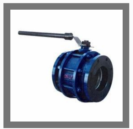
Imported Ball Valves