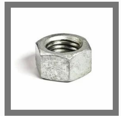
Heavy Hex Nuts