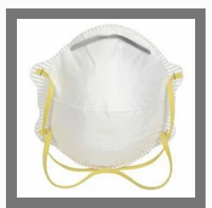
Safety Nose Masks