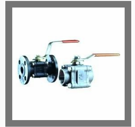
Audco Ball Valve