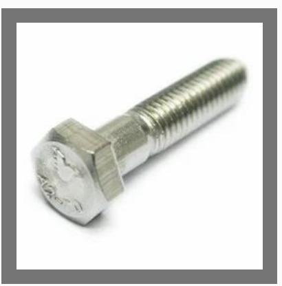
Hex Head Bolts