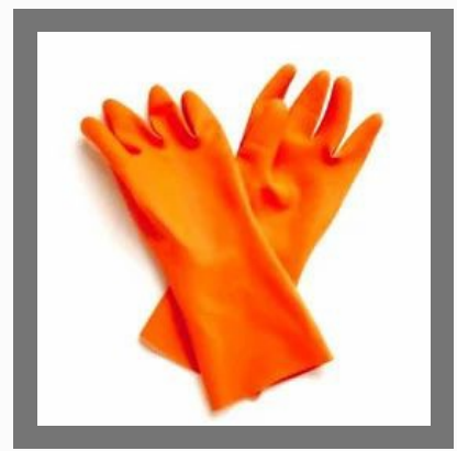
Rubber Safety Hand Gloves