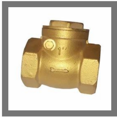
Non Return Valves