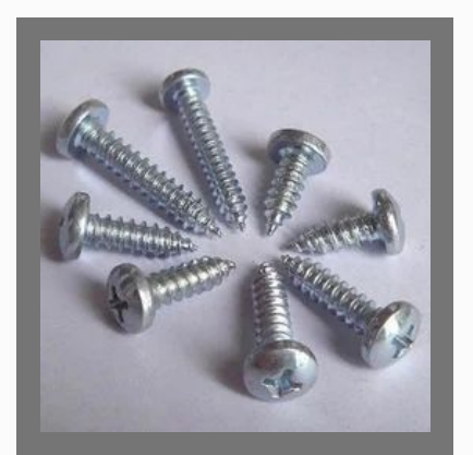
Self Tapping Screws