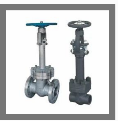
TBS Prv Ball Valve