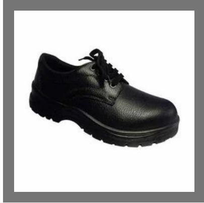
PVC Safety Shoes