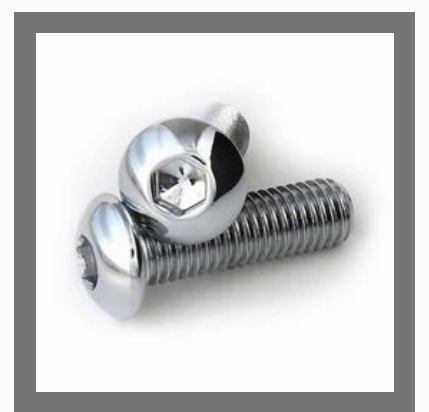
Button Head Screws