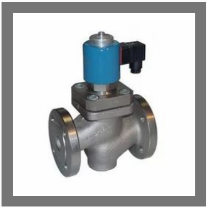
Cast Steel Solenoid Valves