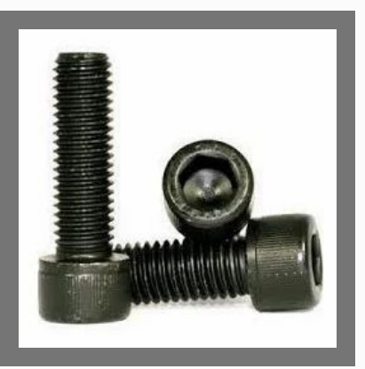
Head Cap Screws