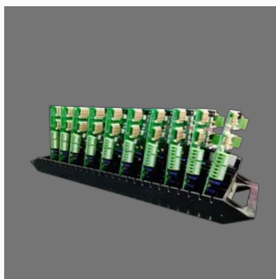
Single Step ZCD Firing Card