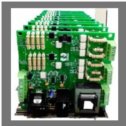
Firing Card - Single Step 2 Line