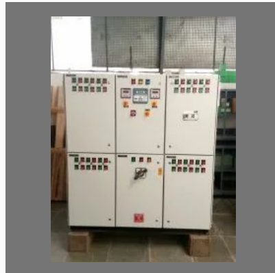
Contactor Switch Apfc Panel