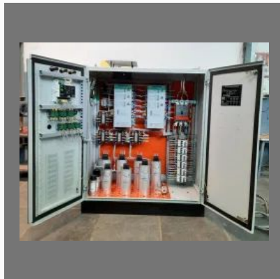
11 Kv HT APFC/LOPFC Panel