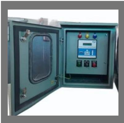
HT Cap Switched Control Box