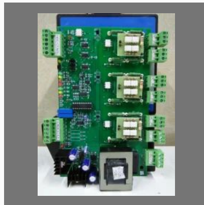
Advanced Firing Card