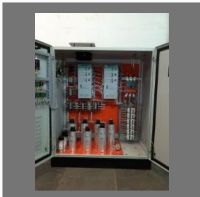
Apfc Panel-AMC CMC Services