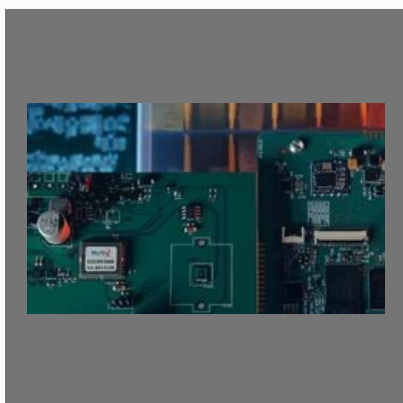
PCB design Service