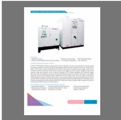
Thyristor Switched APFC System