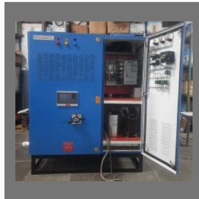
Active Harmonic Filter Panel