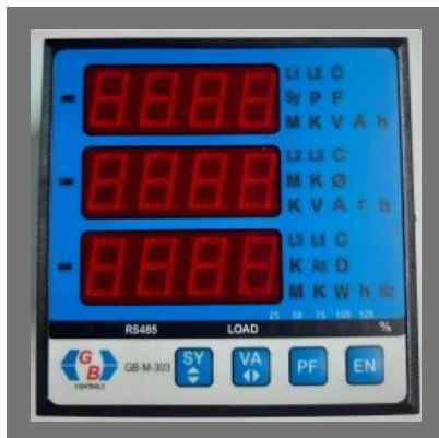
Thd Harmonics Multifunction Meter