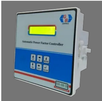
LT Automatic Power Factor Controller (2 Phases, Single CT)