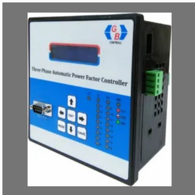
HT Automatic Power Factor Controller (APFC) (3 Phases, 3 Ct)