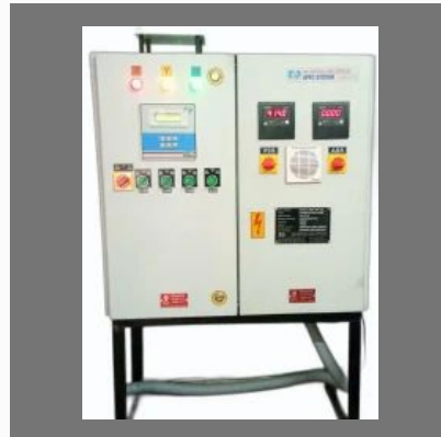
Thyristor Switch APFC Panel