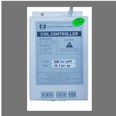
11 KV Vacuum Contactor Coil Controller (11 KV VC ON Control Card)