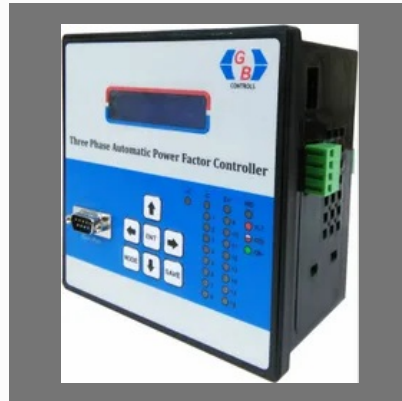
8 Steps LT Automatic Power Factor Controller (APFC) (3 Phases, 3 CT)