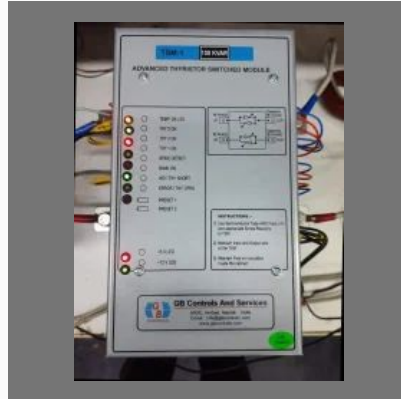
Advanced Thyristor Module