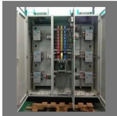
Thyristor Switched Capacitor Panel