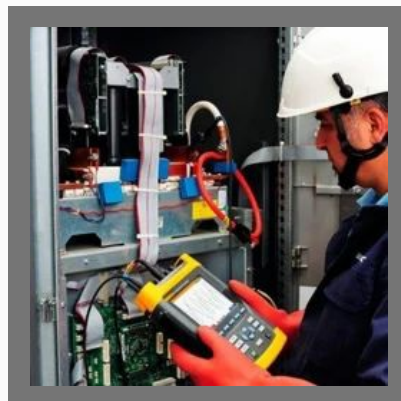
Electrical Energy Audit Service