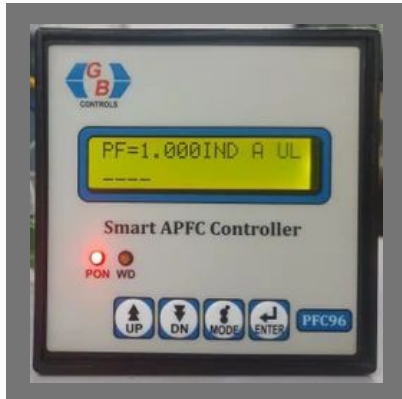
96x96 mm APFC Controller