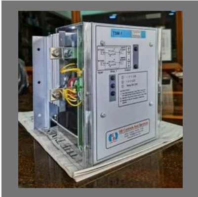
Thyristor Switching Module