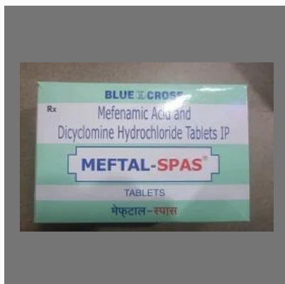
Meftal Spas Tablet