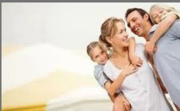
Money Back Plans