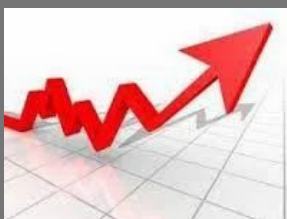
Mutual Fund Consultants