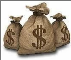
Diversified Equity Funds