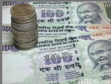
Tax Savings Funds (ELSS)