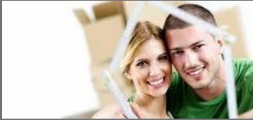
Wealth Creation Planning