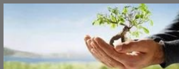
Equity Fund Service