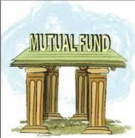
Fund Investments Services