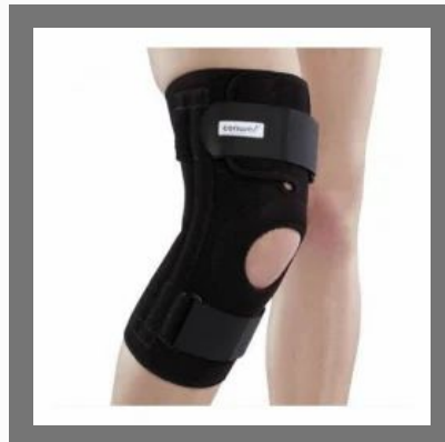
Conwell Rom Knee Brace