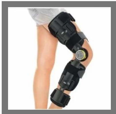
Conwell Length Adjustable Rom Knee Brace