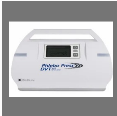
Phlebo Press 603 DVT Pump