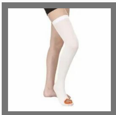
Cotton Anti Embolism Stocking