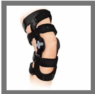
Conwell Defender Ligament Left Knee Brace