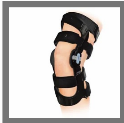
Conwell Defender Ligament Right Knee Brace