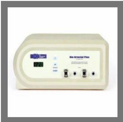
Bio Arterial Plus IC-BAP-DL Compression DVT Pump