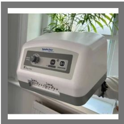
Lympha 960 Mini Press Sequential Compression Device