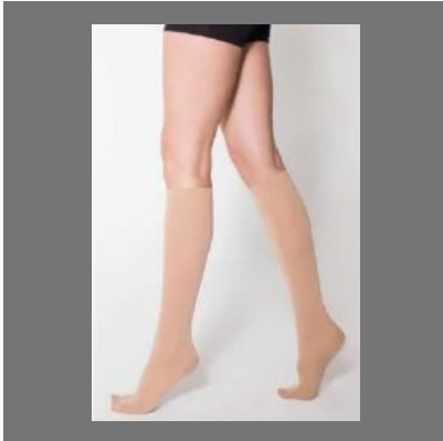
Venomed Knee Length Stocking