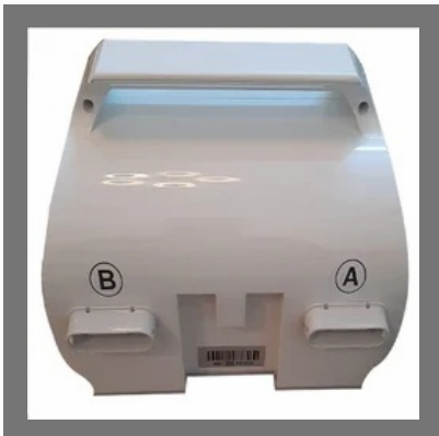
Phlebo Press 650 DVT Pump