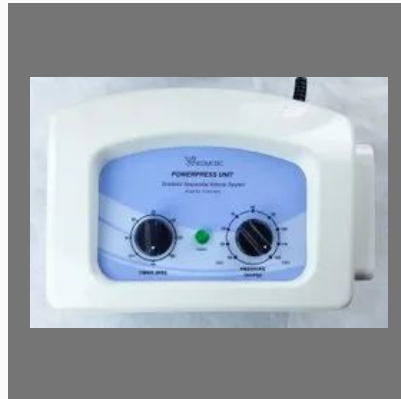
Neomedic P1000 NAS Gradient Sequential Arterial System