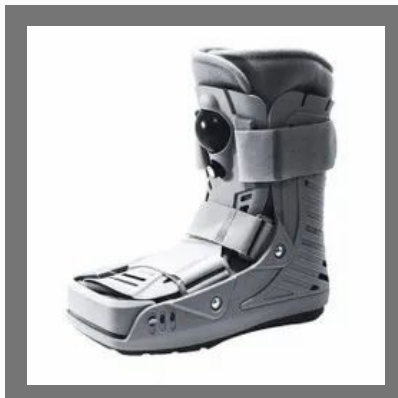
Conwell Air Walker Boot