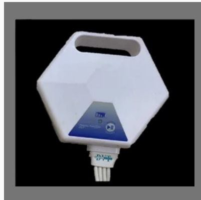
Phlebo Press 760D DVT Pump