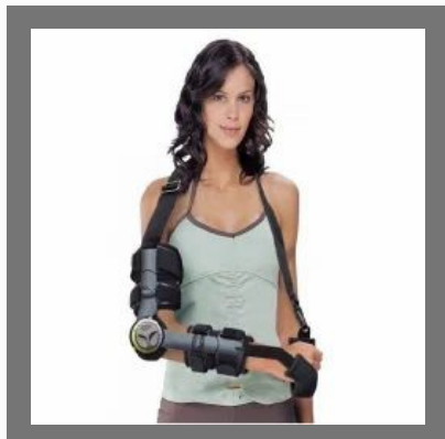
Conwell Rom Elbow Brace