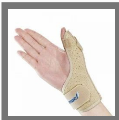
Conwell Thumb Wrist Splint