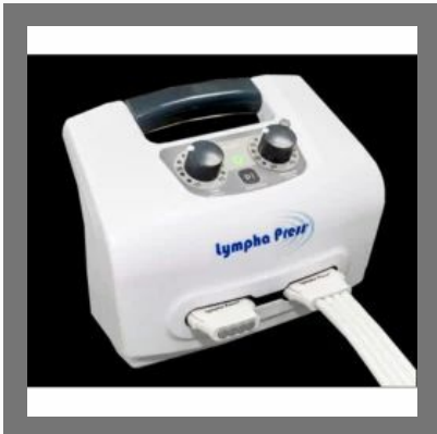
Lympha Press PCD 51 Sequential Compression Device