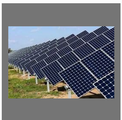
Industrial solar Power Plant