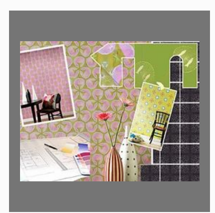
Interior Designing Services