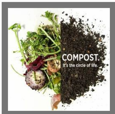
Solid Waste Management