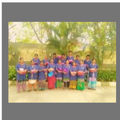
Residential Housekeeping Service