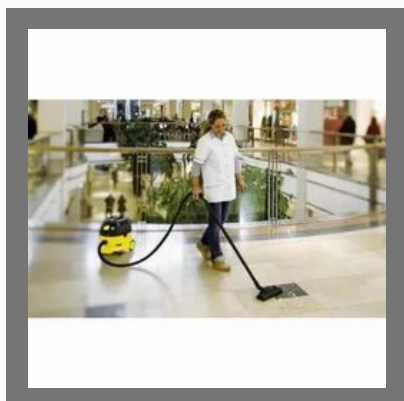
Corporate Housekeeping Service