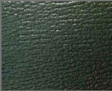
Tango Print Leather