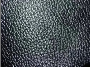
Barton Split Leather