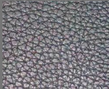
Rambler Print Leather