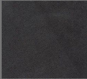
Finished Split Leather