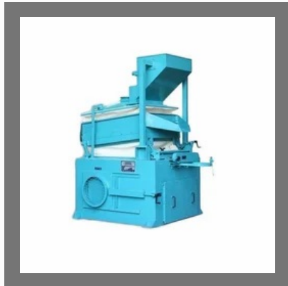
Ragi Cleaning & Destoner Machine