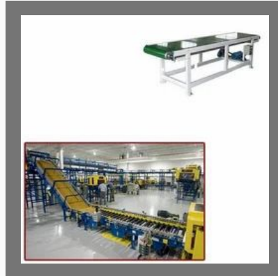
Belt Conveyor for Material Handling