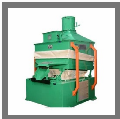
Vacuum type Destoner