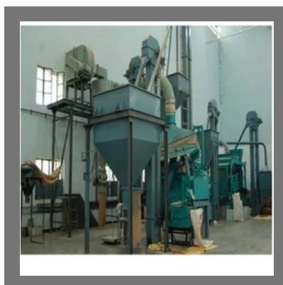
Pulse Cleaning Plant