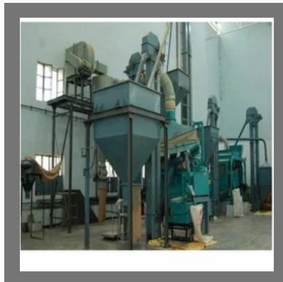
Flax Seed Cleaning Machine