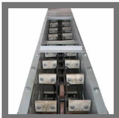
Redler Chain Conveyors