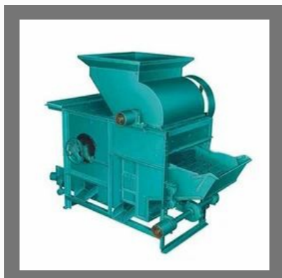
Groundnut Decorticator Machine