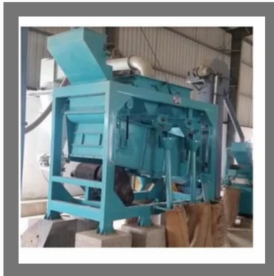
Grain Cleaning Machine