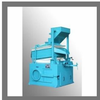
Pressure Type Destoner