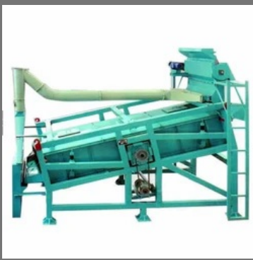
Maize Processing Equipment