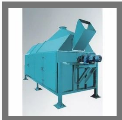
Rotary Drum Sieve