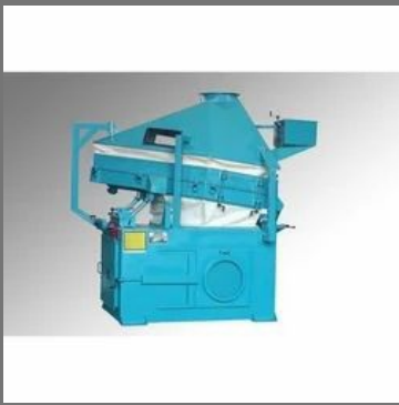
Vacuum Type Gravity Separators