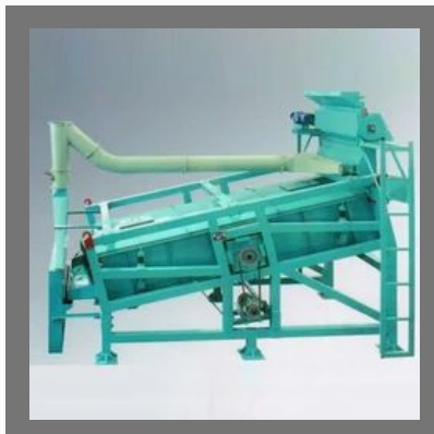
Screen Air Separator