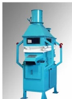
Destoner Machine for Food Industry