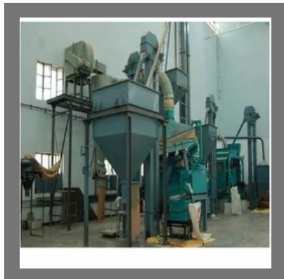
Cumin Seed Cleaning Machine