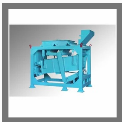
Mongdal Cleaning Machine