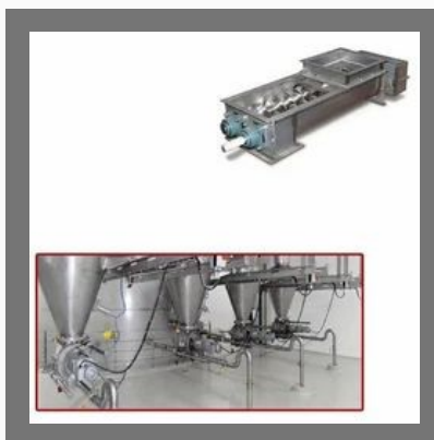
Screw Conveyor for Powder Handling