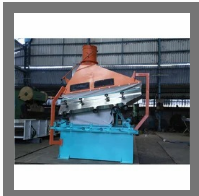
Gravity Separation & Grain Cleaner