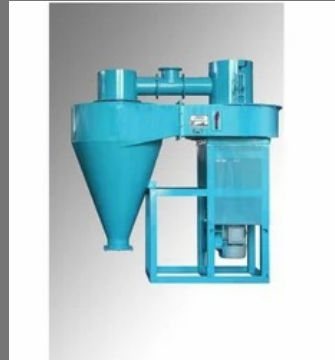
Neem Seeds Dehulling Machine