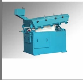
Gravity & Stone Separator