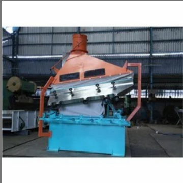
Grain Gravity Separator