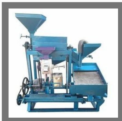
Pulse Mill Plant