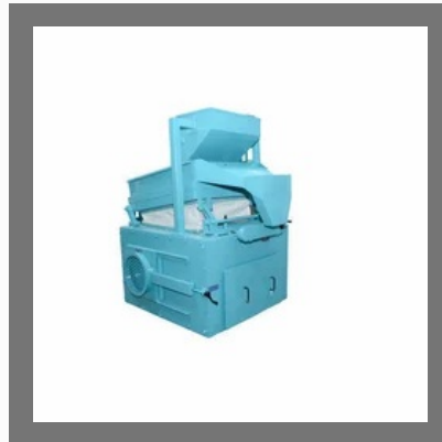
Soya Destoner & Duhuller