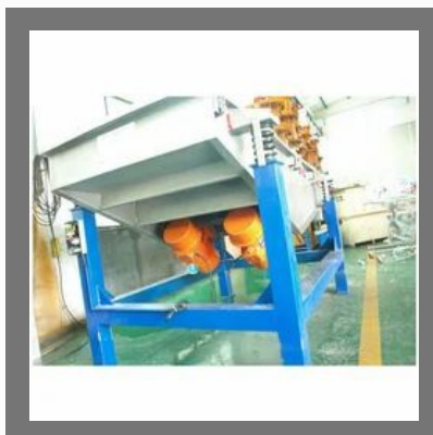
Liquid Screen Separator