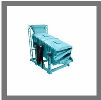
Food Grain Cleaning Machine