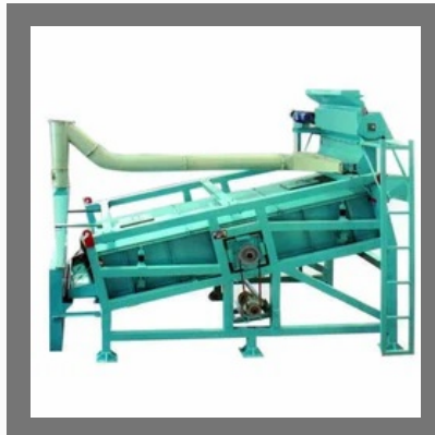
Mustard Seed Cleaning Machine