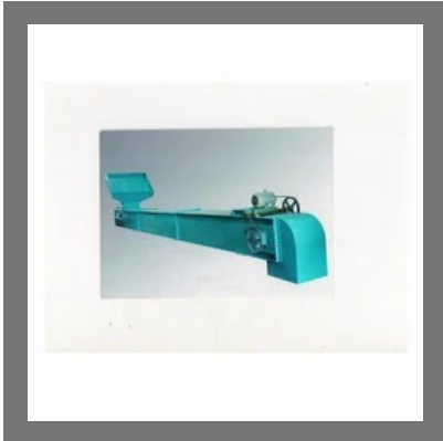
Inclined Belt Conveyor