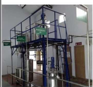
Jatropha Seeds Dehulling System for Bio Diesel Production