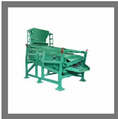
Pre Cleaning Machine