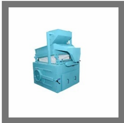
Mini Destoner Machine