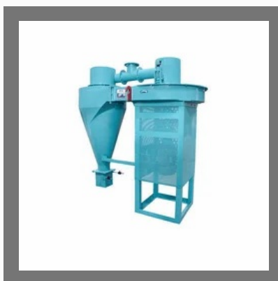
Sunflower Dehulling Machine