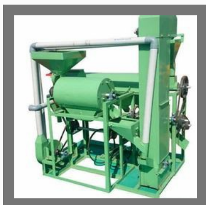
Pulse & Beans Processing Machine