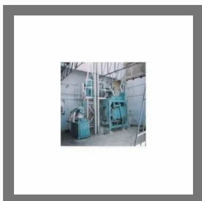
Agricultural Turnkey Solutions