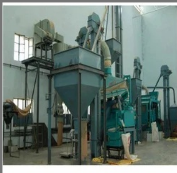
Grain Cleaning Plant