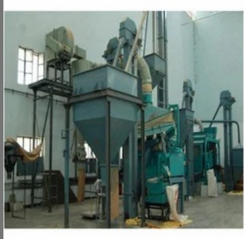
Seed Cleaning & Shorting Plant