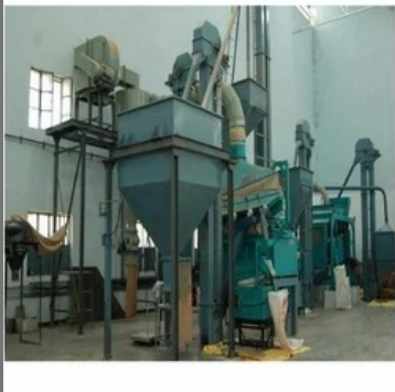
Seed Cleaning & Grading Plant