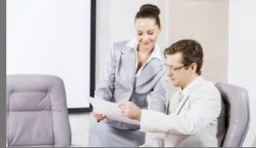
Company Incorporation Work