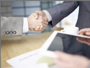
Legal Process Outsourcing Service