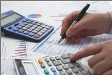
Tax Planning Work