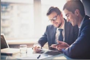
VAT Advisory Service