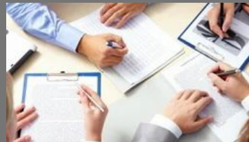
Regulatory Compliance Work