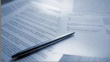
Legal Drafting, Due Diligence, Litigation Service