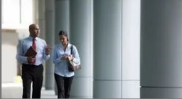
Corporate Law Advisory Service