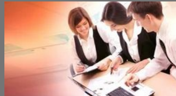
Legal Process Outsourcing Work