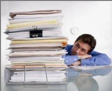
Compliance Management Work