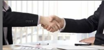
Due Diligence Services