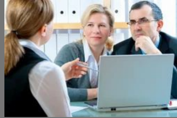
Corporate Advisory, Strategy And Planning