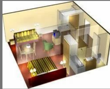
1RK Budget Flats