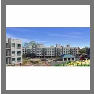
Property In Panvel