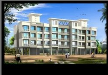
1BHK Budget Flats in Navi Mumbai