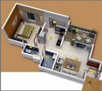
1BHK(550 sq.ft.) Flat In Panvel