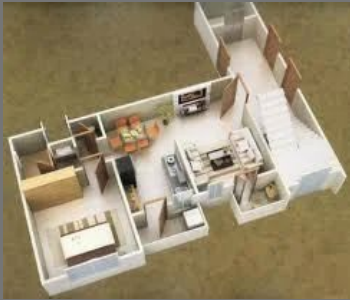
1BHK(550 SQ.FT.) Flat