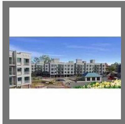
Residential Townships In Panvel