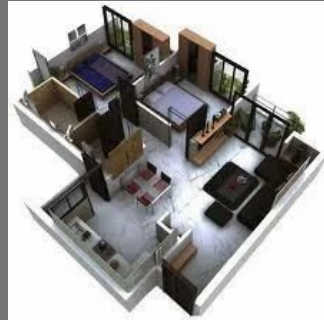
2BHK Affordable Flats