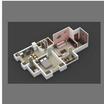
1BHK(650 sq.ft.) Flat In Panvel