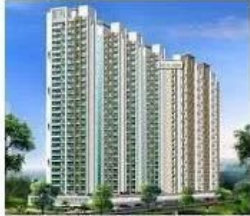
Flats In Karjath