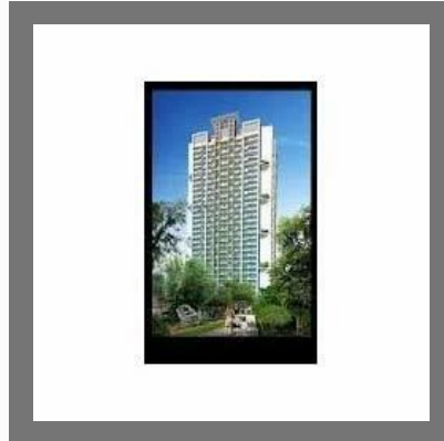
1 BHK Flat In Panvel