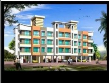
2BHK (775sqft) In Neral, Karjat