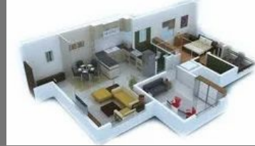
2BHK(850 sq.ft.) Flat In Panvel