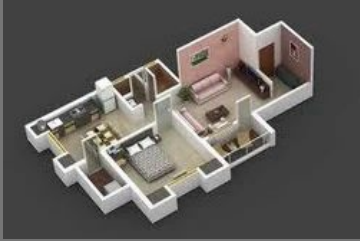
1BHK Affordable Flats