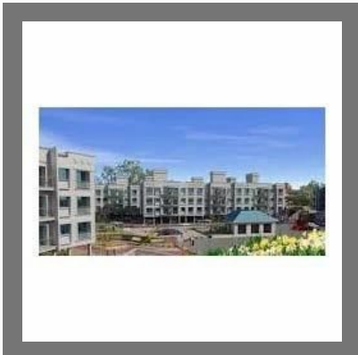
1RK Flat In Panvel