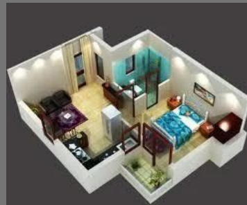
1BHK(550 sq.ft.) Flat In Panvel