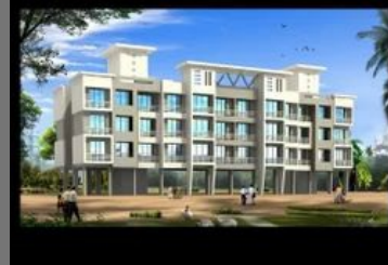
2BHK Budget Flats