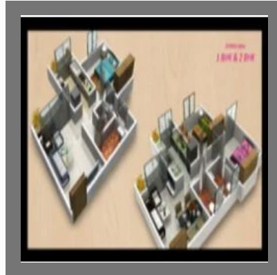
2BHK(840sqft) In Neral, Karjat