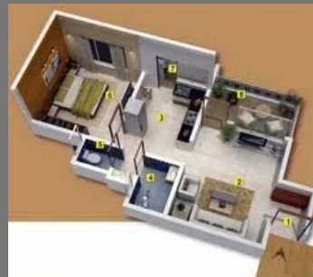
1BHK(610 SQ.FT.) Flat