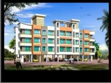
1.5BHK(700sqft) At Neral In Piccadilly Green City, Karjat