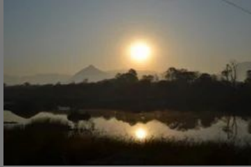
River Side Greens