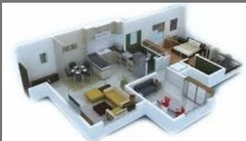
2BHK Budget Flats