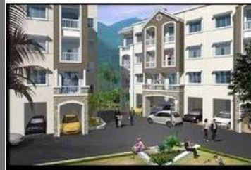
Second Homes In Karjat