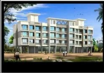
2 BHK Flat In Navi Mumbai