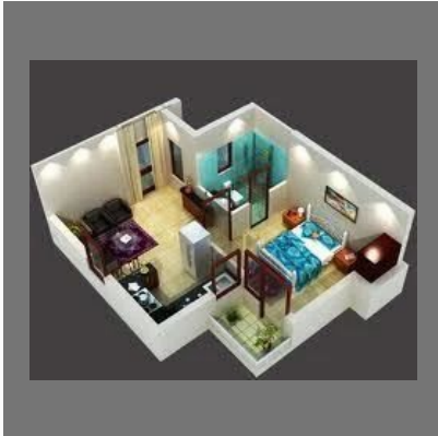
1BHK Budget Flats