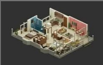
2BHK Budget Flats