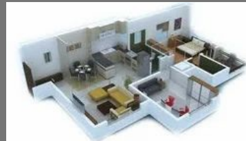
2BHK(850 SQ.FT.) Affordable Flats