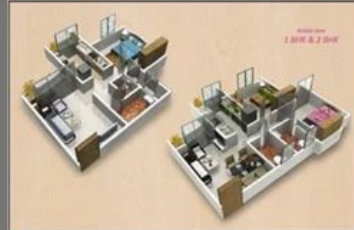
1.5 BHK(750sqft) In Neral, Karjat