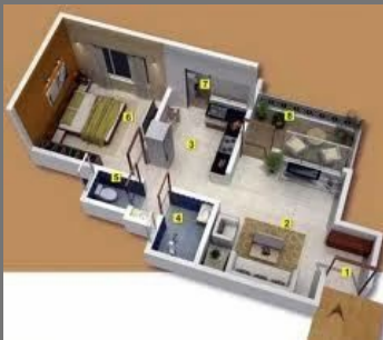
1BHK(550 SQ.FT.) Affordable Flat