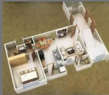
1BHK(610 sq.ft.) Flat In Panvel