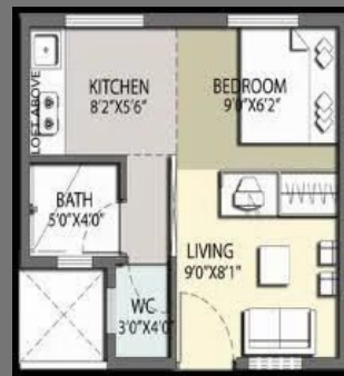
1RK Budget Flats