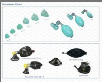
Resuscitator Silicon RS01