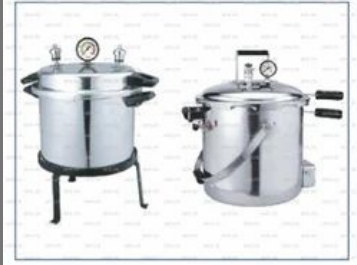
Stainless Steel Autoclave