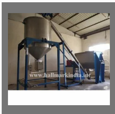
Detergent Powder Mixing Machine