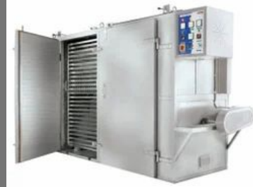
Tray Dryers Machine