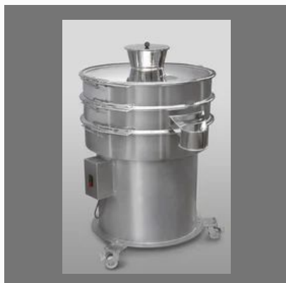
Double Deck Vibro Sifter