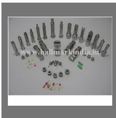
Diamond Shape Tablet Dies Punches