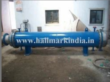
Shell and Tube Heat Exchanger