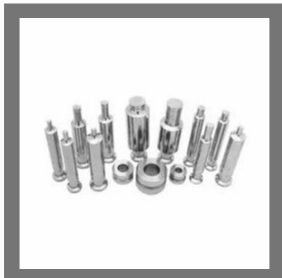
Tablet Dies Punches