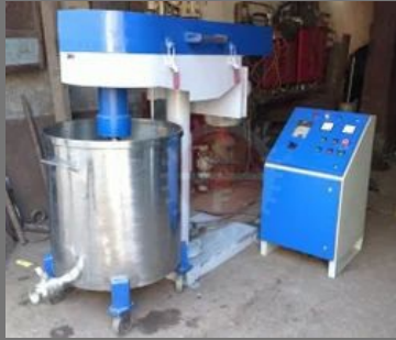
High Speed Dispenser