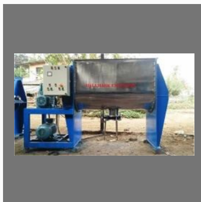
Stainless Steel Food Powder Mixer