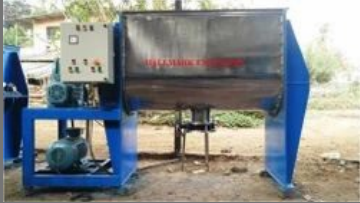
Powder Mixer Machine