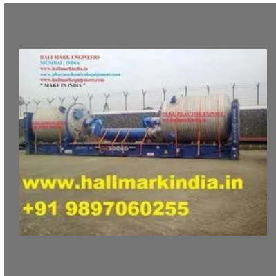
Internal Coil Reaction Vessel