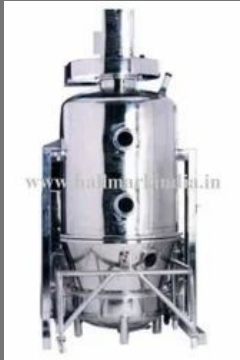
GMP Fluid Bed Dryer