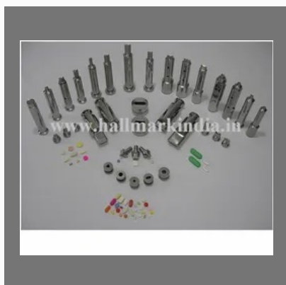
Oval Shape Tablet Dies Punches