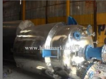
Stainless Steel Chemical Reactor