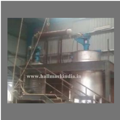
PVA Emulsion Plant