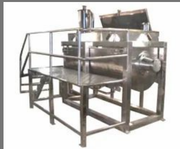
GMP Ribbon Blender