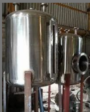
Stainless Steel Receiver