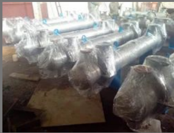
Stainless Steel Industrial Heat Exchangers