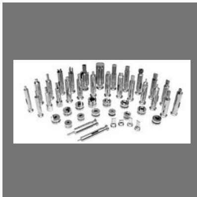
Caplet Shape Tablet Dies Punches