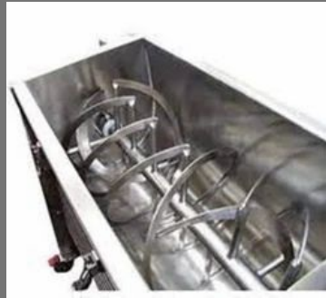
Ribbon Mixer Machine