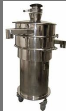
Vibrator Sifter Machine