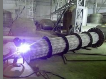
U Tube Heat Exchanger