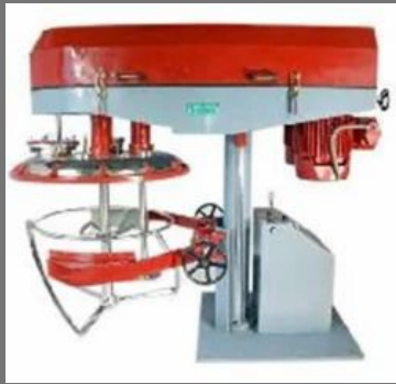
Twin Shaft High Speed Dispenser