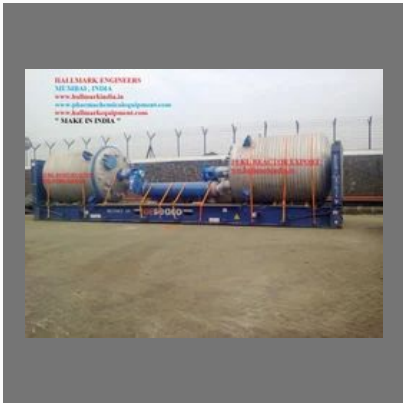
Alkyd Resin Plant