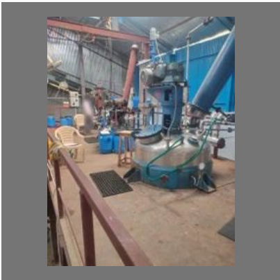
PVA Adhesive Plant