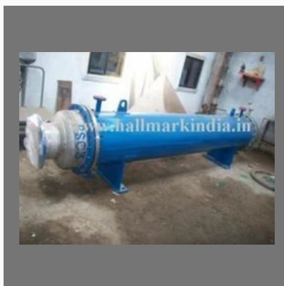
SHELL & TUBE CHEMICAL CONDENSER