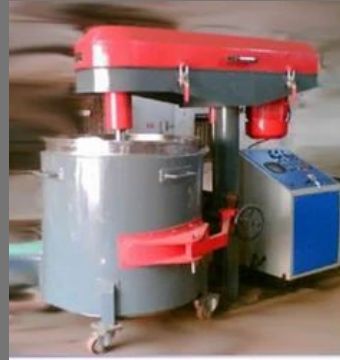
High Speed Paint Dispenser