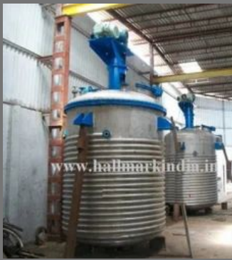
Stainless Steel Reactors