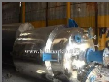
API Chemical Reactors