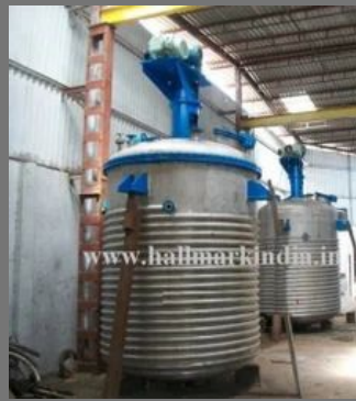
Limpet Coil Reactor