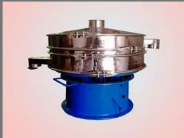
48" Double Deck Vibro Sifter