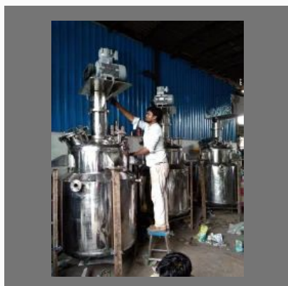
Pharmaceutical GMP Reactor