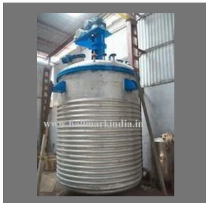
Limpet Coil Reactor