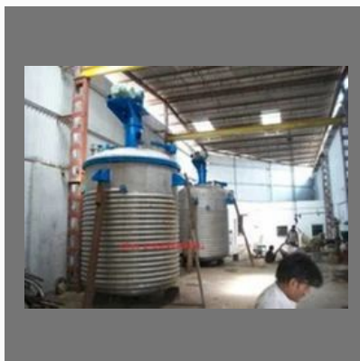
SS316 Chemical Reactor