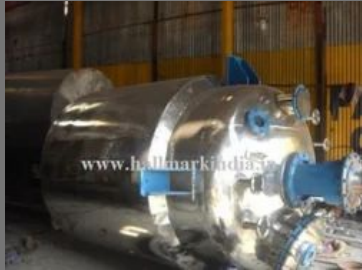
Pharmaceutical Chemical Reactors