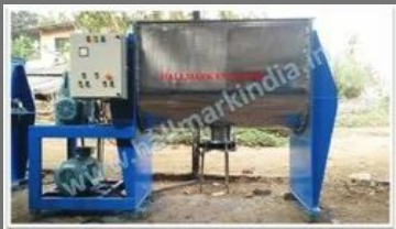
Dry Powder Mixer