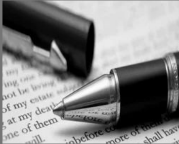
Legal Documentation Services