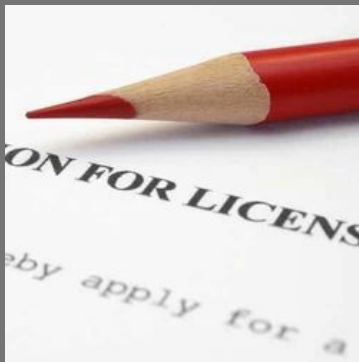
Business Setup Consultancy Services