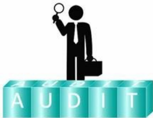
Statutory Auditing Services