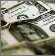
Foreign Advisory Services