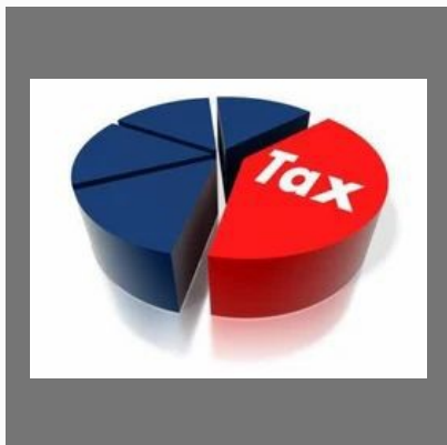
Tax Consultancy Service