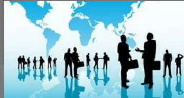
International Tax Advisors