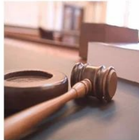
Corporate Legal Advisor