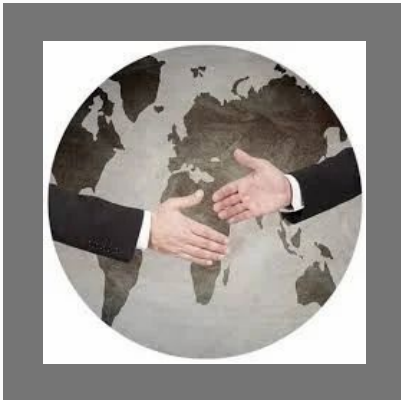
International taxation Attorneys