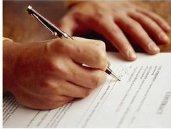
Legal taxation Services