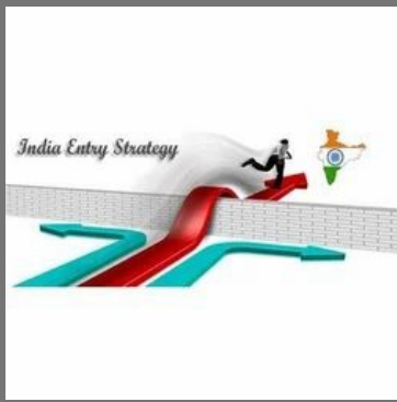
India Entry Strategy Services