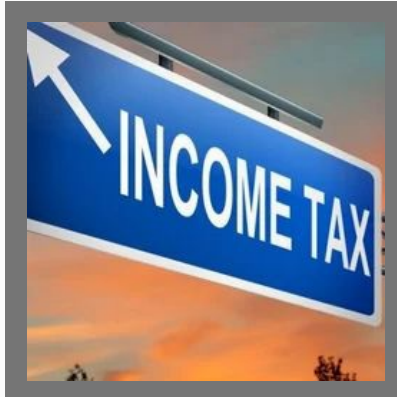
Income Tax Filing