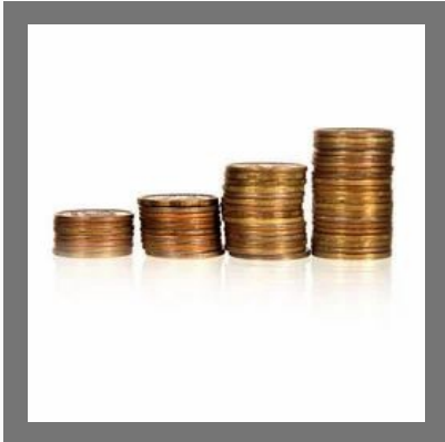
Transfer Pricing Studies