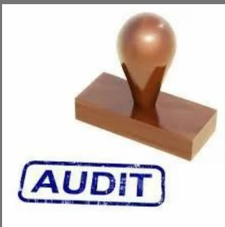
Business Audit Services