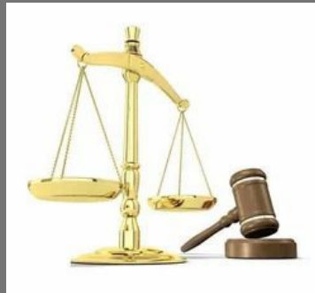
Litigation Support Services