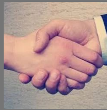
Representative Of Forgein Companies