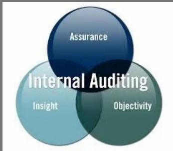
Internal Auditing Service