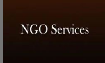
Ngo Registration Service