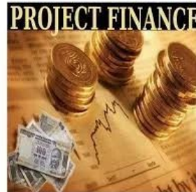
Arranging Project Finance