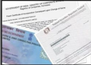
Branch, Project, Liason Office Of Foreign Company