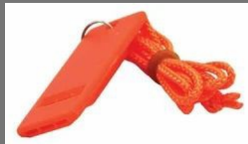
Marine Safety Whistle