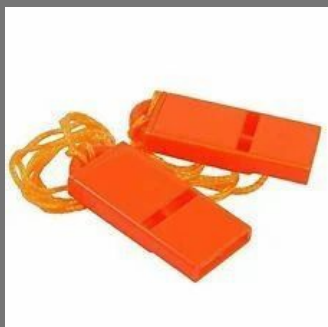
Shoreline Marine Survival Whistle