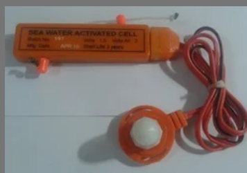
Sea Water Activated Cell