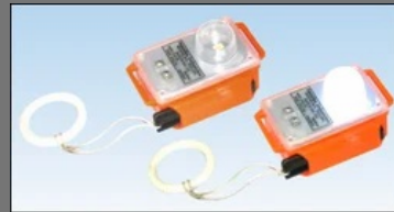
Life Jacket Light Flashing Type