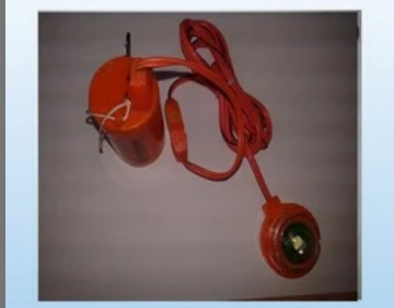
Internal Life Raft / Life Boat Light