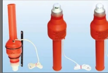
Life Buoy Light Dry Cell Type