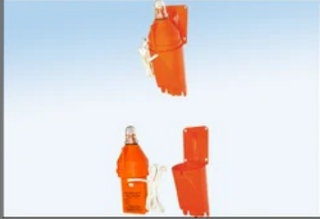
Life Buoy Light S I Light