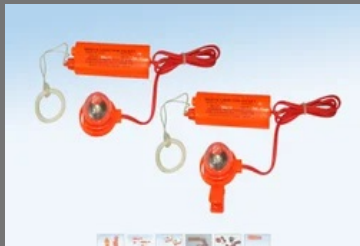
Life Jacket Light Rescue Light Steady Type