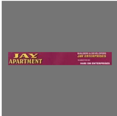
Jay Appartments Nalasopara West Cidco