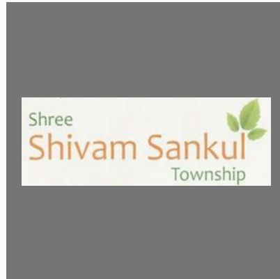
Shivam Sankul Nalasopara