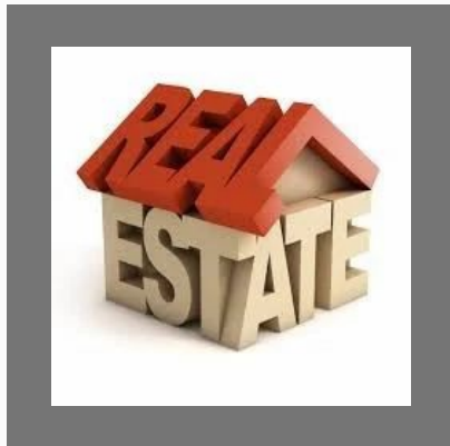
Real Estate Service