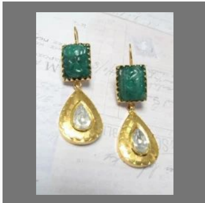
Green Aventurine Gemstone Earrings