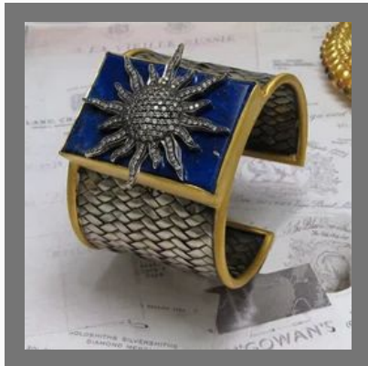
Lapis Gemstone Sun Ray Design Basket Weave Cuff Bangle