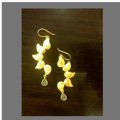
Designer Handmade Gold Plated Costume Earrings