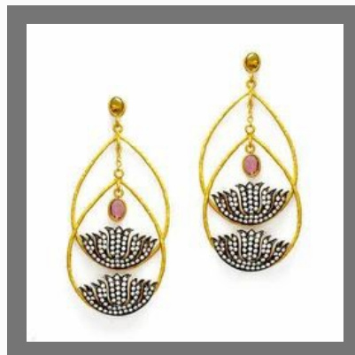
Silver Plated Earring