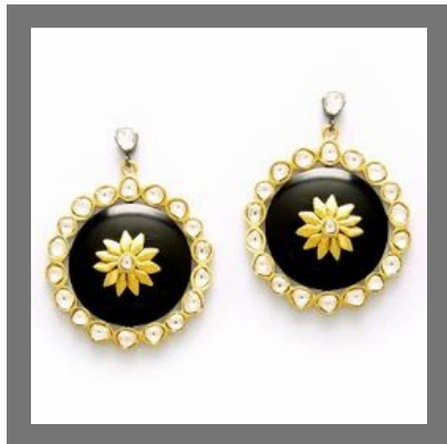
Uncut Cz Stone Bakelite Tribal Earrings