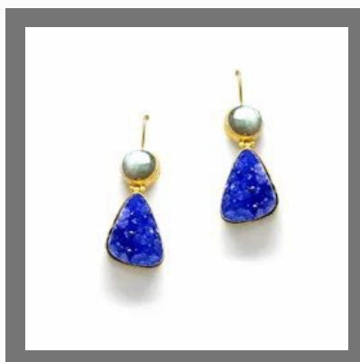
Handmade Designer Druzy Stone Earrings