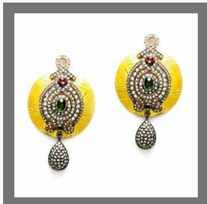
Tourmaline Pave CZ Earrings Jewelry