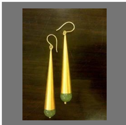
925 Sterling Silver Earring