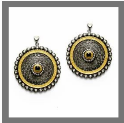
Filigree Tribal Hammered Pave CZ Earring Jewelry