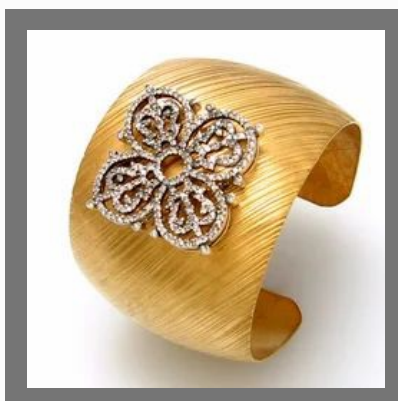
925 Sterling Silver Textured Cz Cuff Bangle Jewelry