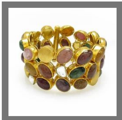
Multi Coloured Tourmaline Bracelet