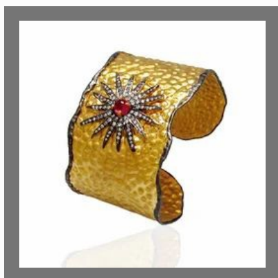
Gold Plated Handmade Designer Hammered Cuff Cz Bangle