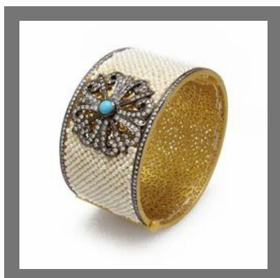
925 Sterling Silver Ethnic Pave Cz Beaded Pearl Bangle