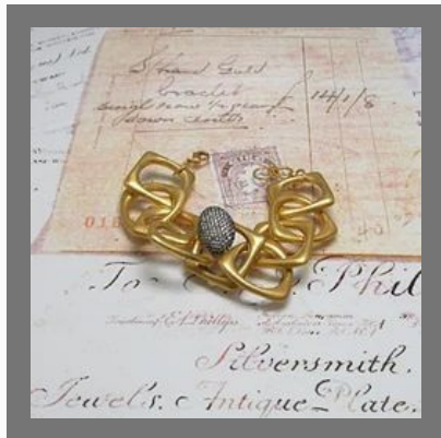
Square Link Bracelet Studded Cz Beads