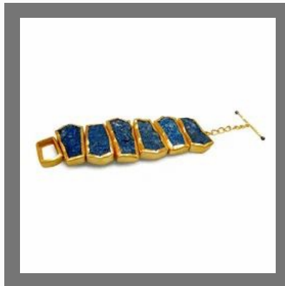
Ethnic Raw Rough Lapis Designer Bracelet