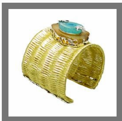
Ethnic Designer Trendy Basket Weave Cuff Bangle