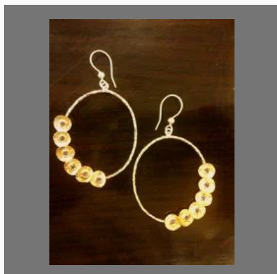
Gold Plated Light Weight New Fashion Design Earrings