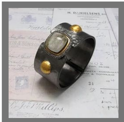
Cabochon Gemstones Cz Black Rhodium Cuff Bangle