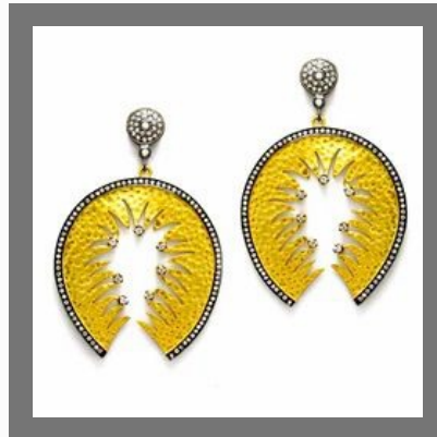
Gold Plated Pave CZ Textured Tribal Earrings