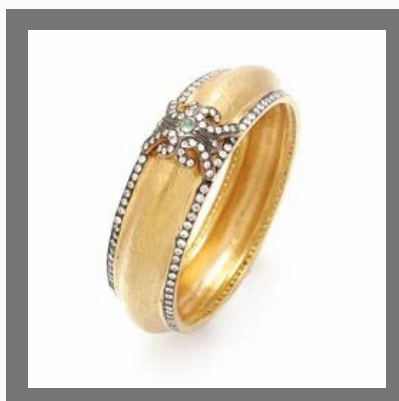
Designer Handmade Gold Plated Pave Bangle