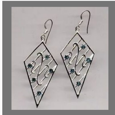
Sterling Silver Earrings