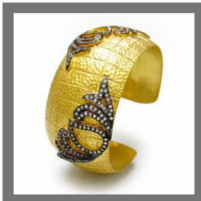
Sterling Silver Gold Plated Pave Cz Studded Cuff Bangle