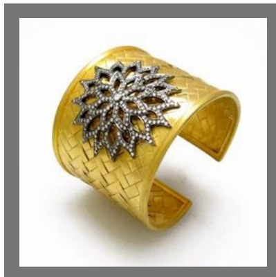
Basket Weave Cuff Pave Cz Gold Plated Bangle