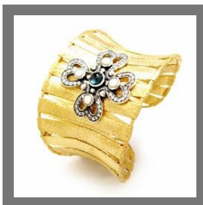
Gemstone Pave CZ Floral Handmade Design Cuff Bangle