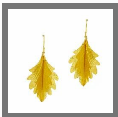
Leaf Gold Plated Earring