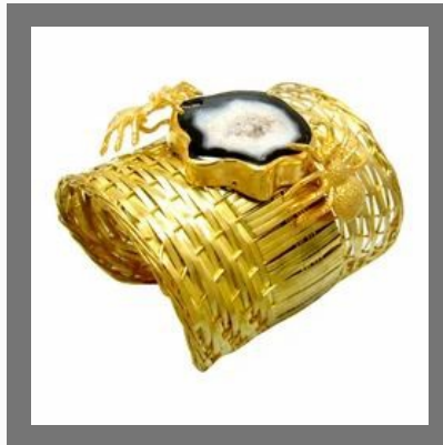
Gold Plated Silver Agate Gemstone Spider Designs Bangle