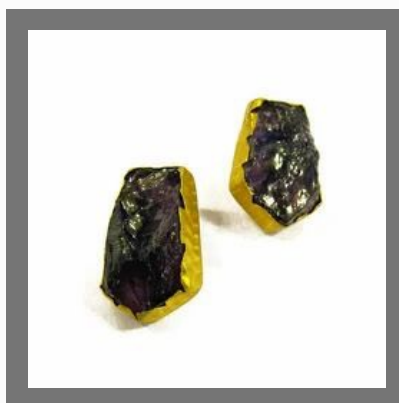
Semi Precious Stone Earrings