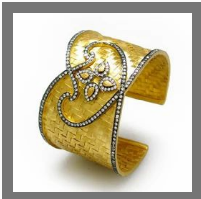
Basket Weave Designs Cz Studed Cuff Bangle