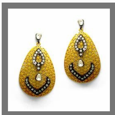
925 Sterling Silver Pear Shap Cz Dangle Earrings