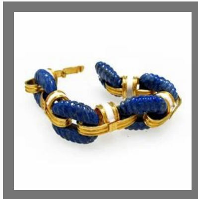
Beautiful Carved Lapis Lazuli Link Bracelet