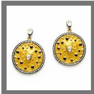
Gold Plated Round Shaped Hammered Disc Earrings