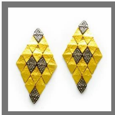
Gold Plated New Fashion Designs Pave Cz Earclips