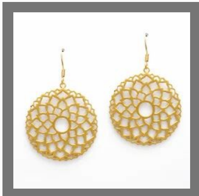
Designer Handmade Geometric Gold Plated Earrings