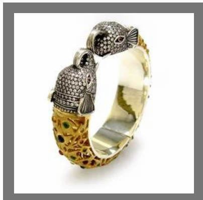
Natural Tourmaline Elephant Cuff Bangle