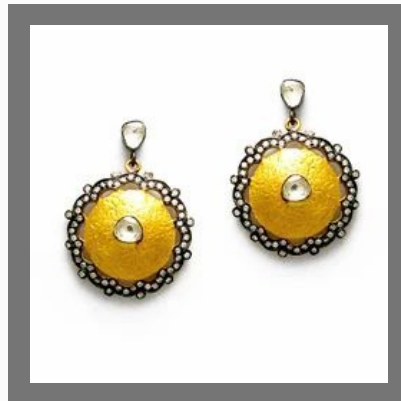
Women Gold Plated Disc Fashion Earrings