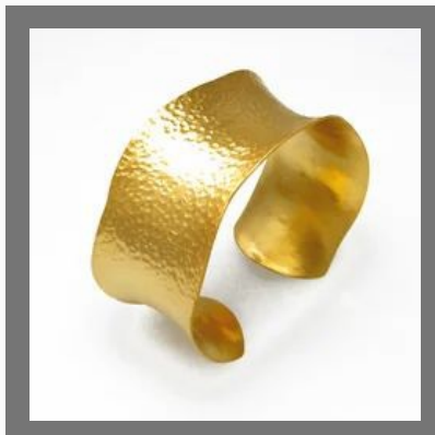
925 Sterling Silver Textured Finished Women Cuff Bangle