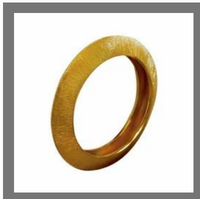
Gold Plated Textured Handmade Design Bangles