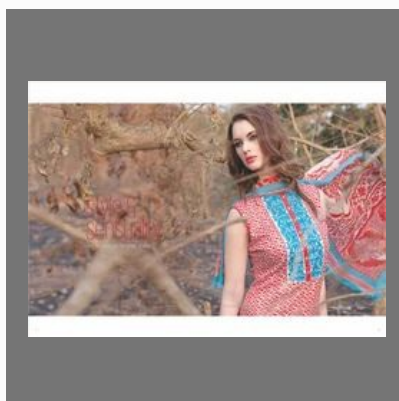
Ladies Salwar Suits