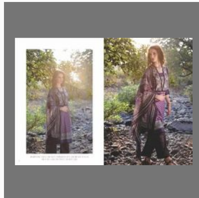
Fashion Fantasy Ladies Salwar Suits