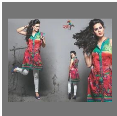
Ladies Salwar Suits