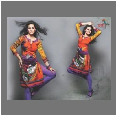
Swah Kurtee Ladies Salwar Suits