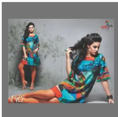
Swah Kurtee Ladies Salwar Suits