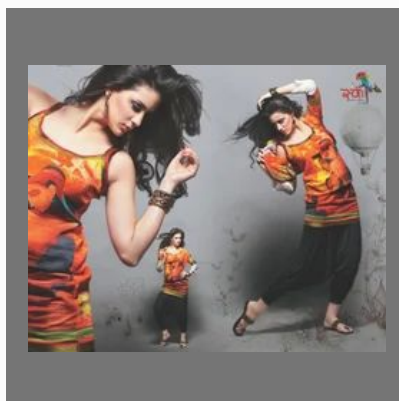
Ladies Salwar Suits