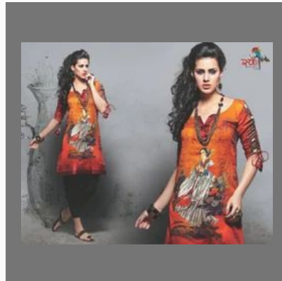
Swah Kurtee Ladies Salwar Suits