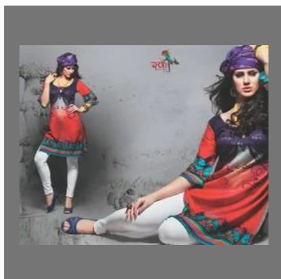
Ladies Salwar Suits