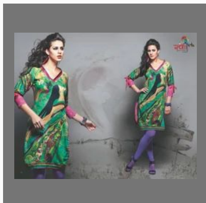
Swah Kurtee Ladies Salwar Suits