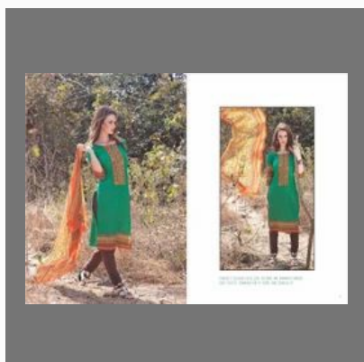
Ladies Salwar Suits