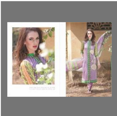
Fashion Fantasy Ladies Salwar Suits