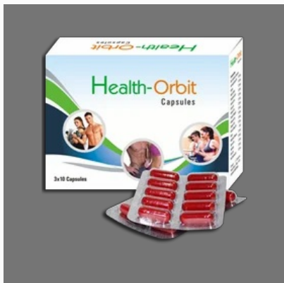
Health Orbit Capsules