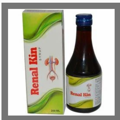
Renal Kin Syrup