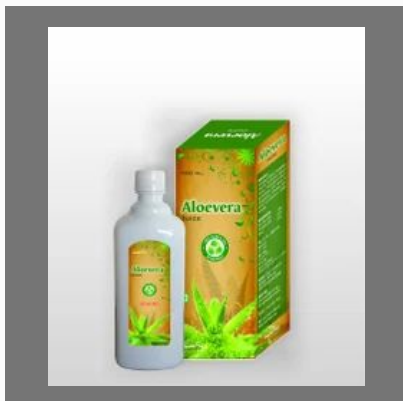
Aloe Vera Juice