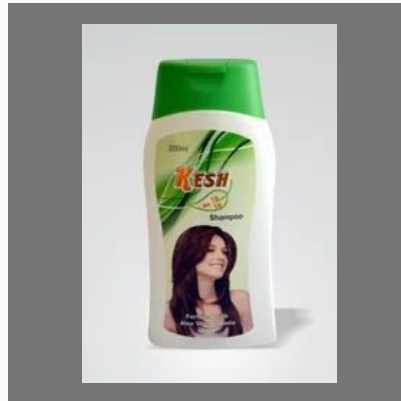
Aloe Vera Shampoo