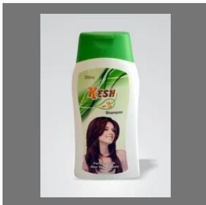
Kesh 10 On 10 Shampoo