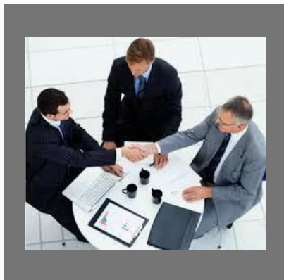
PCD Pharma Franchise