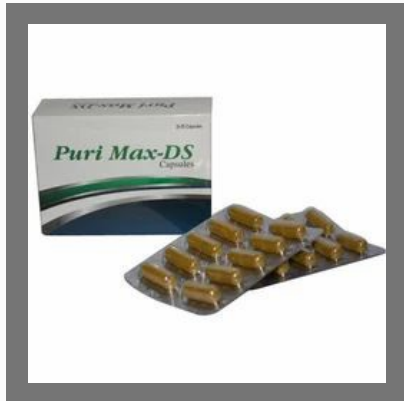
Herbal Blood Purifier Capsules