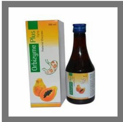
Herbal Orbizyme Syrup