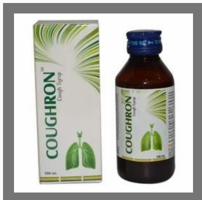
Herbal Cough Syrup