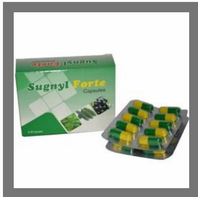
Ayurvedic Anti-Diabetic Capsules