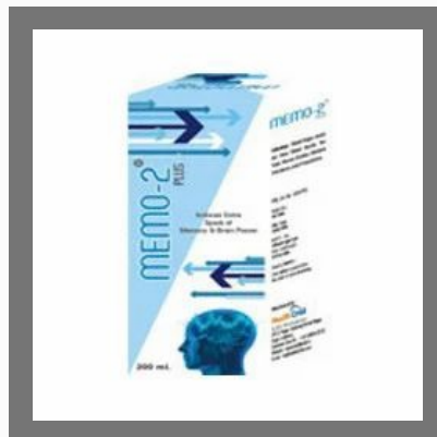
Ayurvedic Memory Tonic