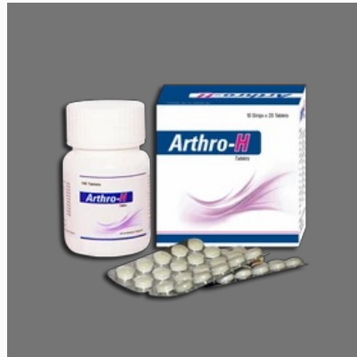
Herbal Joint Pain Tablets