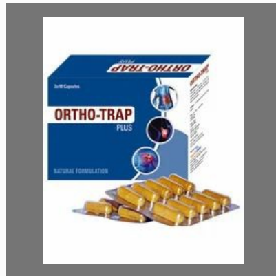
Ayurvedic Arthritis Medicine