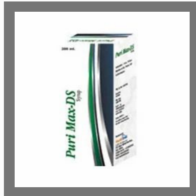
Harbal Blood Purifier