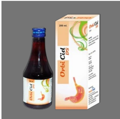
Orbicid Ds Syrup