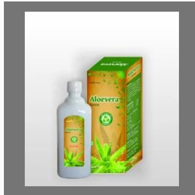
Aloe Vera Health Drink