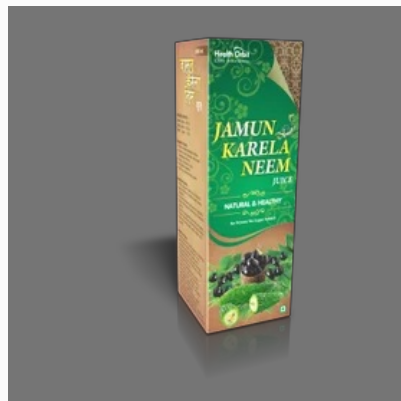
Jamun Karela Neem Carton