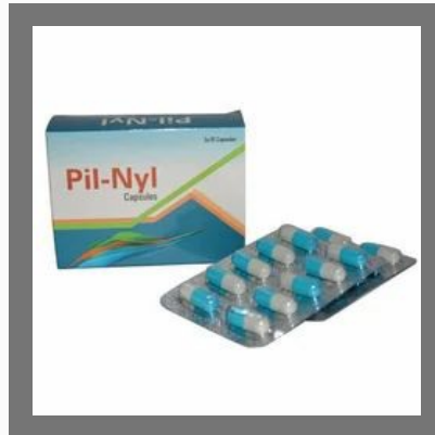
Ayurvedic Piles Medicine