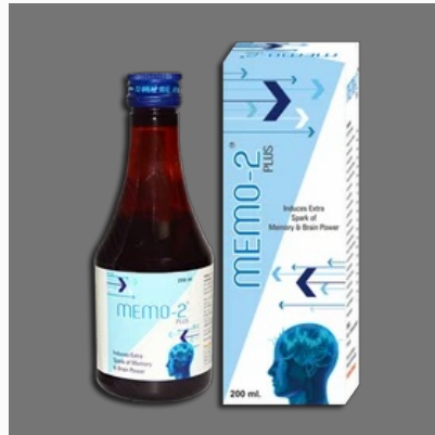
Memo -2 Plus Syrup